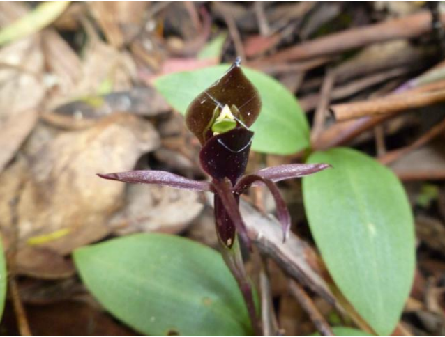
Fig. 4. A beautiful, burgundy-coloured Chiloglottis orchid ( C. ?grammata ), Mt Wellington, Hobart.