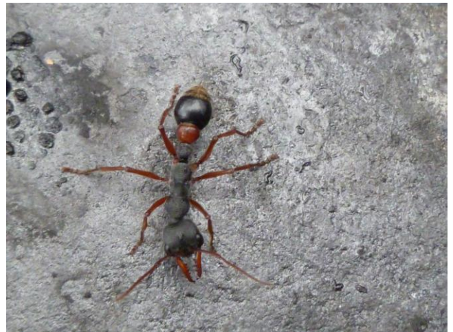
Fig. 6. The fearsome Jack jumper ant ( Myrmecia pilosula ) (10-12mm long), thankfully displayed here at greater than life size.

burgundy-coloured Chiloglottis (probably C. grammata , Fig. 4), potato orchids ( Gastrodia sesamoides , known in Australia by the more poetic name, 'Cinnamon bells', Fig. 5), and several greenhoods. We also had our first encounter with Jack jumper ants ( Myrmecia pilosula ), a native bull ant with a nasty sting and a characteristic pebbly nest (Fig. 6). Over the next two days we searched the parks and rivulets of Hobart and enjoyed a walk to a known T. octoblepharum site with Lyn Cave of the Tasmanian Herbarium.