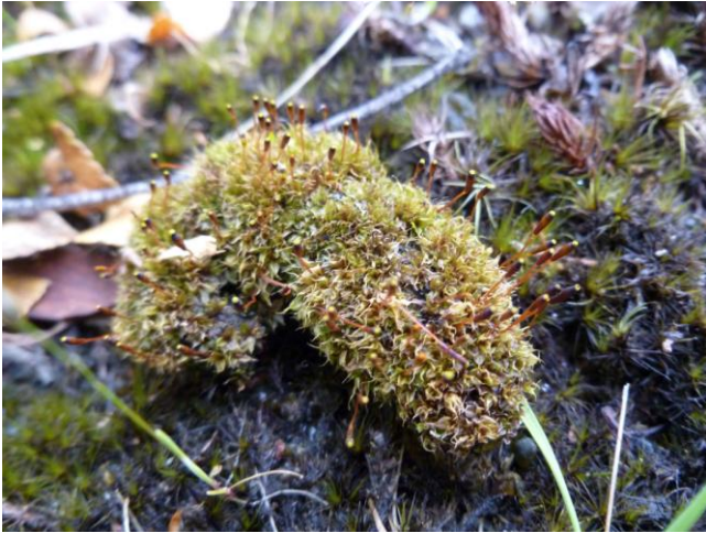
Fig. 8. Wallaby dung with a well established specimen of Tayloria octoblepharum .

A daytrip to the Tasman Peninsula yielded some small specimens of Splachnaceae along roadsides and carparks (again, largely found by our chief moss spotter, Georgia) and some marvellous coastal views (Fig. 7).