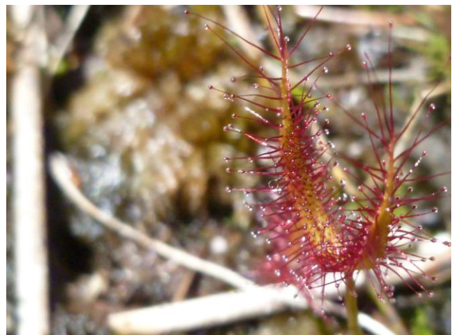
Fig. 11. Drosera ?binata An almost iridescent red sundew at Ted's Beach on the shore of Lake Pedder.

The Wedge River picnic area presented us with a great many specimens of Tayloria gunnii and T. octoblepharum growing on wallaby dung (Fig. 8, 9). Ted's Beach had large amounts of T. octoblepharum , and the endemic T. tasmanica , including one clump growing healthily in an old broken beer bottle (Fig. 10)! We also found a diverse array of carnivorous plants, including two distinct types of sundew (probably Drosera pygmaea and D. binata ; Fig. 11) and a bladderwort ( Utricularia sp.).