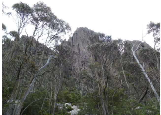
Fig 2. The impressive Organ Pipes, a geological feature halfway up Mt Wellington, Hobart, Tasmania.

Before we could study the Tasmanian Splachnaceae, we first had to find them. This was no easy task because carrion and dung are so ephemeral that old records do not necessarily indicate present distributions. Nonetheless, armed with records from the Tasmanian Herbarium we began our search on Mt Wellington in Hobart. Though there was an impressive view and many interesting mosses and vascular plants at the summit, Splachnaceae were not to be found.