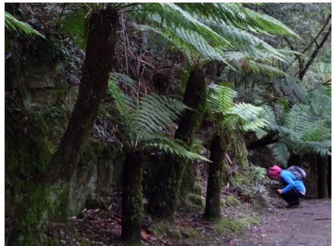
Fig 3. Georgia Cummings, moss whisperer, in the field.

We encountered our first success at a site half way down Mt Wellington, the "Organ pipes", an impressive geologic formation (Fig. 2). One of our group, Georgia, quickly established a reputation of being an