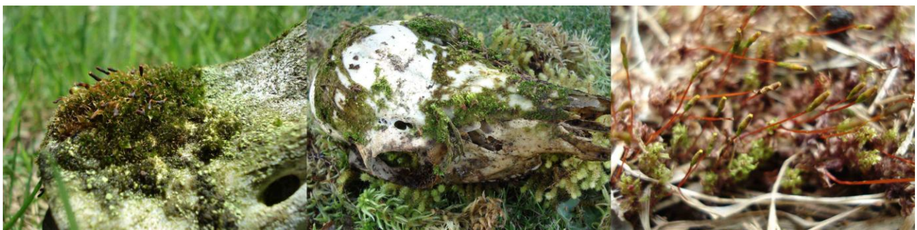
Fig 1. From left to right, Tayloria octoblepharum growing on a deer vertebra, T. purpureascens on a deer skull, and T. callophylla on the ground at the Old University Hut site in Swanson.

We encountered our first success at a site half way down Mt Wellington, the "Organ pipes", an impressive geologic formation (Fig. 2). One of our group, Georgia, quickly established a reputation of being an