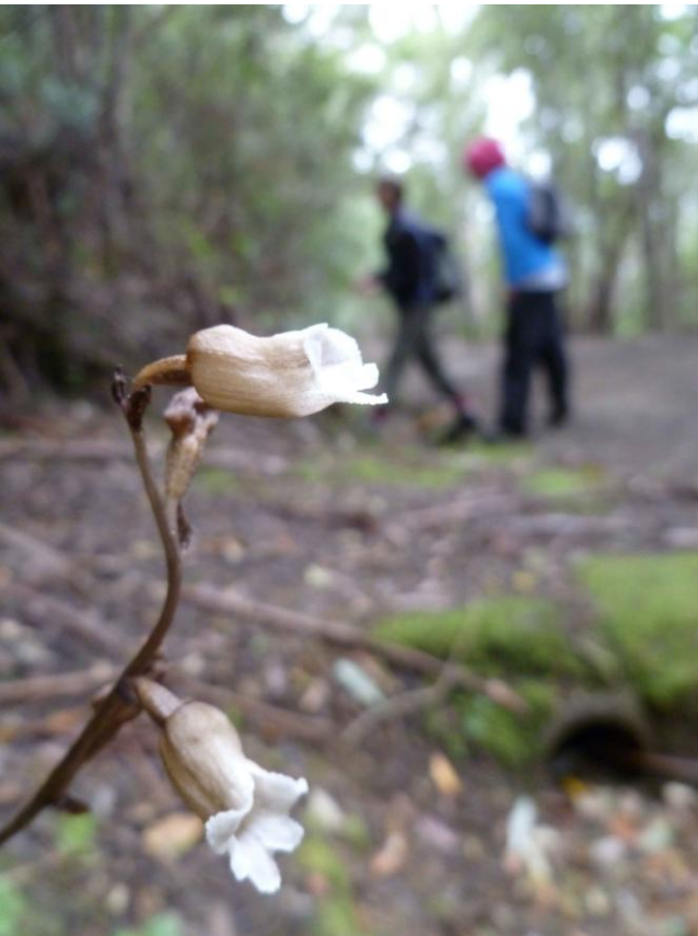
Fig 5. Intrepid moss-hunters Anne Gaskett and Georgia Cummings are not distracted by the poetically named 'Cinnamon bells' ( Gastrodia sesamoides ) - in the foreground.

excellent Splachnaceae spotter, and found our first specimen, T. octoblepharum behind a barbeque area built into the side of the slope (Fig. 3). There was no evidence of carrion or dung, but perhaps sufficient material was washed down from further up the slope? Unfortunately, we needed mosses in their reproductive phase with sporophytes, something these specimens lacked! Methodically searching the immediate area and proceeding to the Organ Pipes did not yield any further results, although we enjoyed the stunning alpine Eucalyptus growing around rocky scree slopes, some charming orchids, including