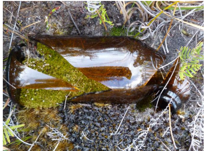
Fig 10. An old beer bottle seems to serve just fine as a cosy home for Tayloria tasmanica , easily identifiable by the conspicuous white capsules on the sporophytes.

found several Splachnaceae growing on the characteristically cube-shaped dung of wombats. Our main field sites were found around the edge of the artificial Lake Pedder. Damming the Gordon River to create Lake Pedder for hydroelectric power within a designated world heritage zone was a controversial move that kick-started the conservation movement in Tasmania in the 1970s and generated the world's first green political party (Kellow 1989). Our brief visit to a logging protest camp in the Florentine forests abutting the World Heritage Area showed us that management and conservation of natural resources is still highly contentious in Tasmania.