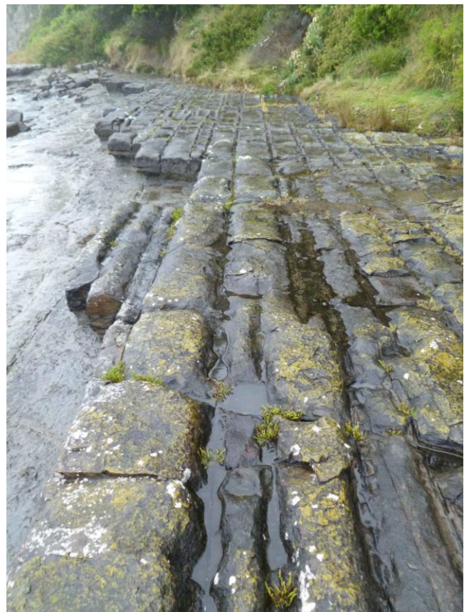
Fig. 7. The Tessellated pavement, a rather unique rocky shore on The Tasman Peninsula, east of Hobart.