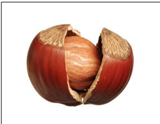
Nut or Not?

Which one is the true nut? You’ll have to read the paper. If you’d like a PDF of it, send a request to john.steel@botany.otago.ac.nz