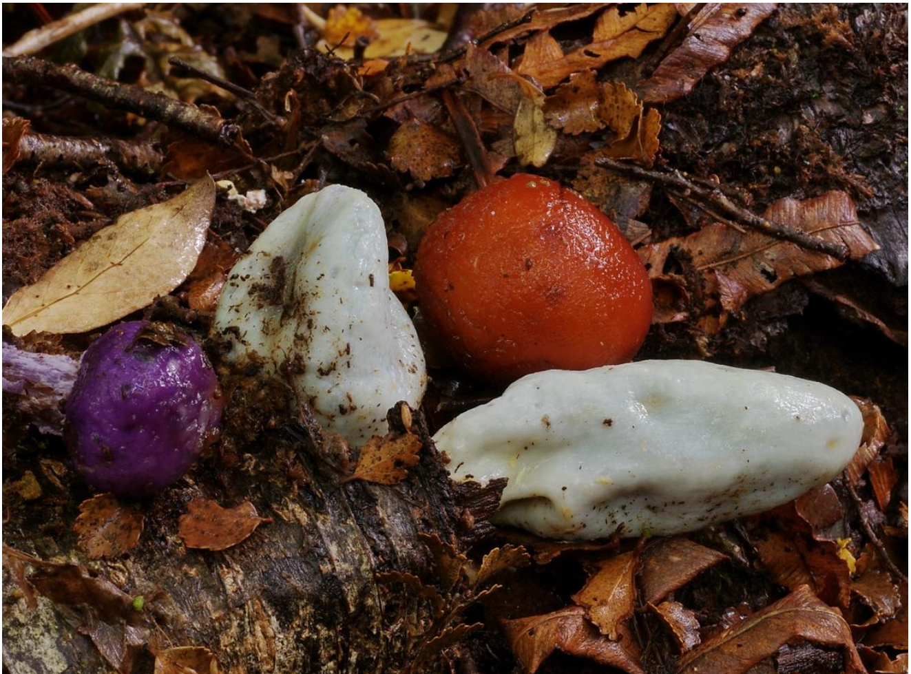
Photo Below: Cortinarius porphyroideus (left), Weraroa virescens (centre and bottom right) and Cortinarius perauranticus ( top right) Fruiting bodies of the three species showing contrasting colours. Martins Hut Track, Longwood Range, 26th NZ Fungal Foray, Riverton.

The trip was botanically interesting. There is a good track round the Island and the trip to Goat Island was even more rewarding as regrowth is entirely natural, though there was a much higher proportion of weeds.