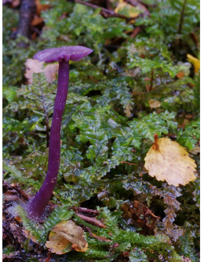
Laccaria violaceonigra, Martin Huts Track, Longwood Range, 26th NZ Fungal Foray, Riverton.