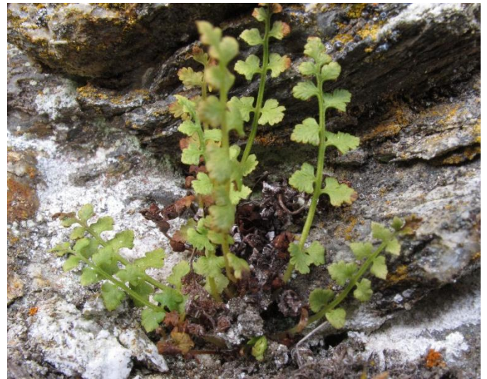
Anogramma leptophylla in the Pisa Ranges.