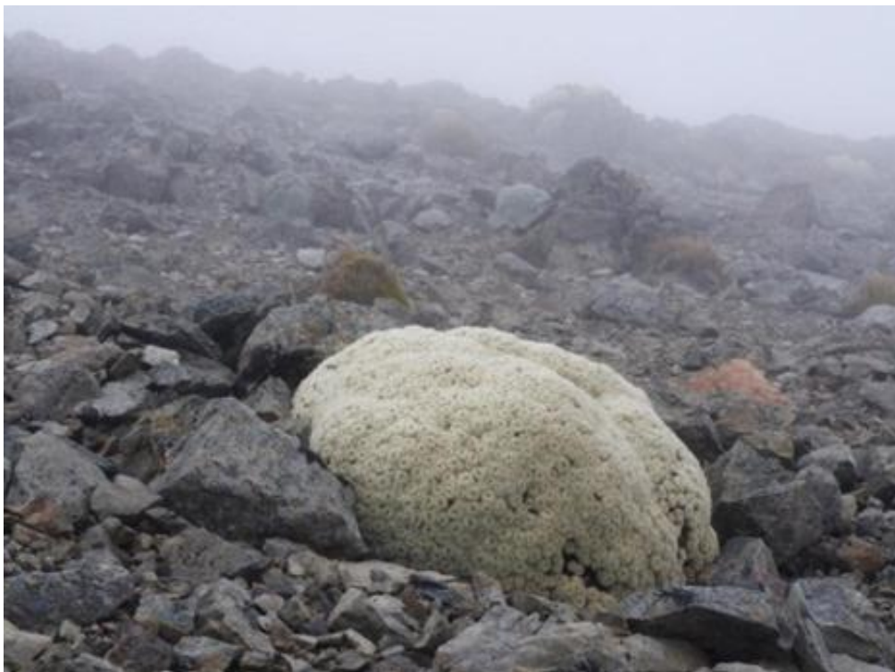
Plants in Landscape Section of Botanical Society Photography Competition: 'Mysterious Vegetable Sheep'.