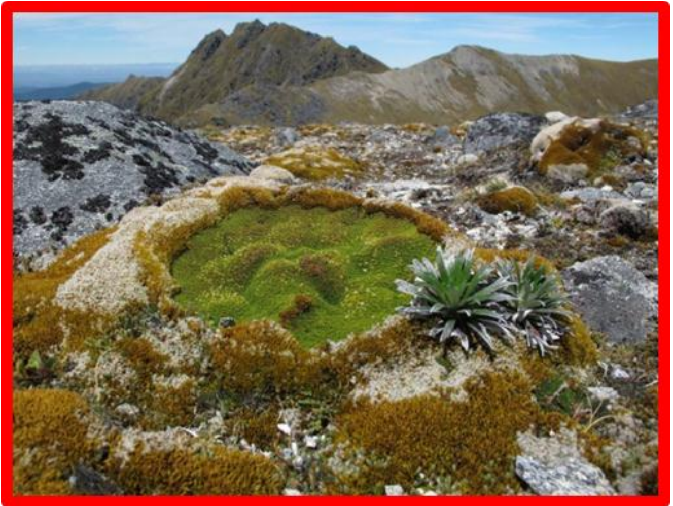
Overall Winner of the Botanical Society Photography Competition: 'Scale of Mountains' by Lorna Little