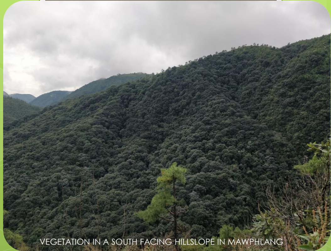
VEGETATION IN A SOUTH FACING HILLSLOPE IN MAWPHLANG

LOCAL TOUR TO SHELLA, EAST KHASI HILLS, MEGHALAYA W.E.F. 09/10/2020 TO 11/10/2020