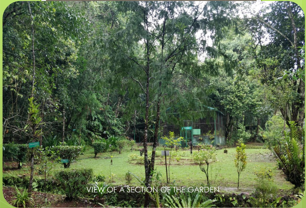
VIEW OF A SECTION OF THE GARDEN