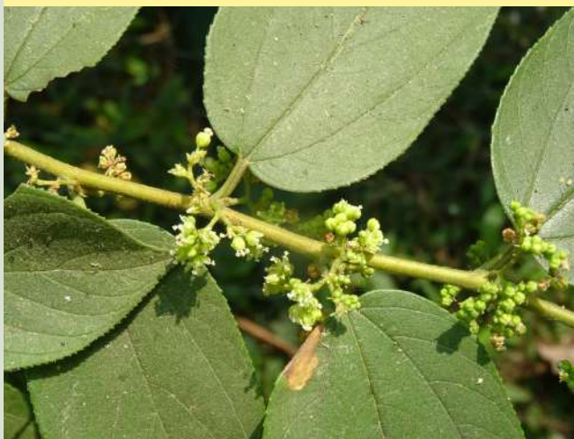
Trema orientalis (Cannabaceae)