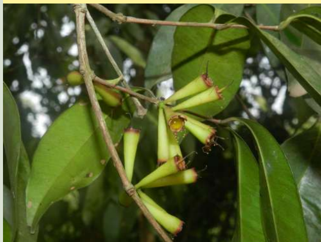
Syzygium lanceolatum (Myrtaceae)