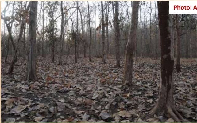
View of typical Dry Deciduous Forest, Panna Tiger Reserve, Vindhyan ranges, Madhya Pradesh