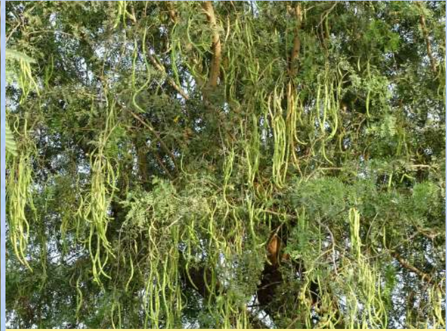
Prosopis cineraria (Fabaceae) in fruiting condition at AZRC garden, Jodhpur