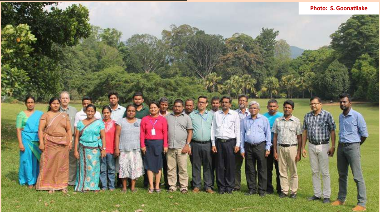
BSI Scientists at IUCN Red List Assessor Training and Ebony Assessment Workshop at Royal Botanic Gardens, Peradeniya, Sri Lanka from 24th–28th April 2017

Thanks to all the scientists and staff of regional centres and units of Botanical Survey of India for contributing to this Newsletter