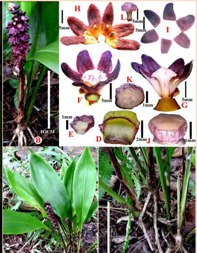
Tupistra ashioi (Asparagaceae) – a new species from Northeast India