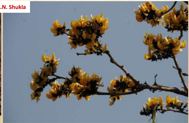
Butea monosperma (Leguminosae)