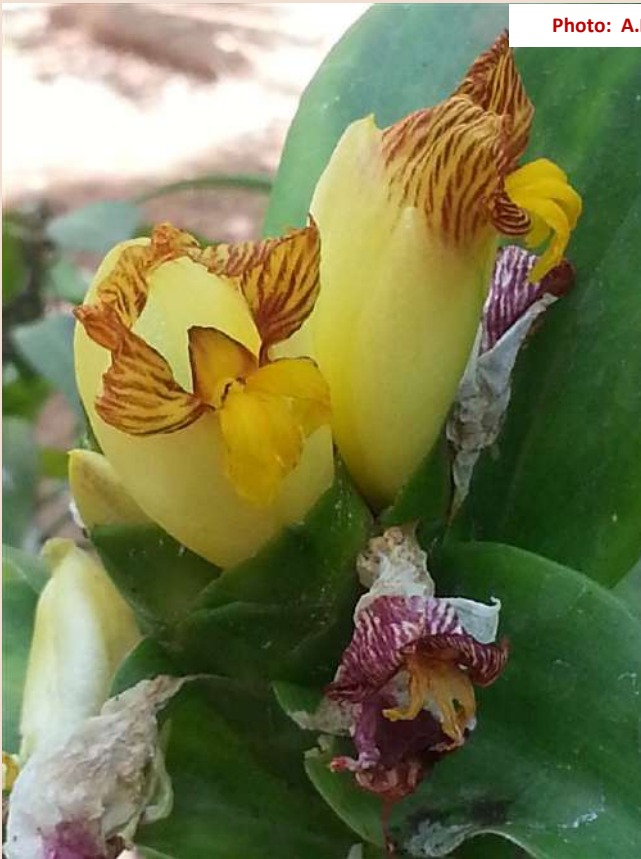
Costus pictus (Costaceae) in WRC Garden, Pune