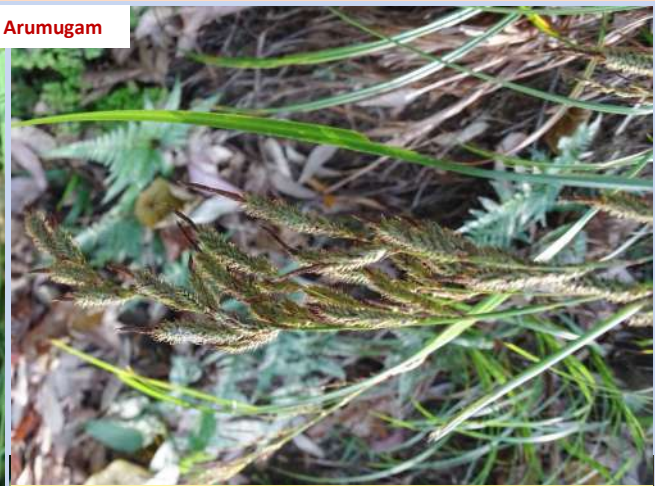
Carex myosurus (Cyperaceae) from Agasthyamalai hills