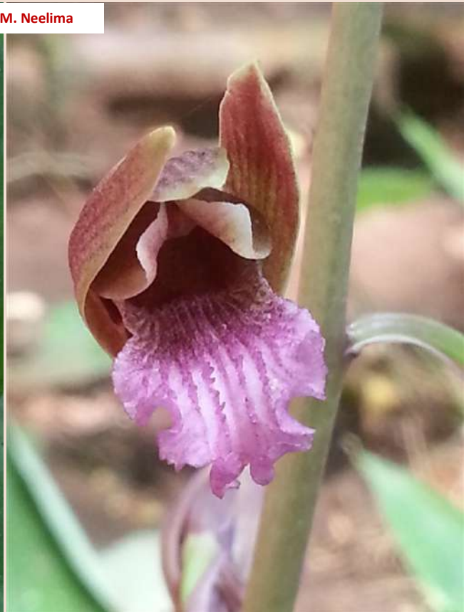
Eulophia spectabilis (Orchidaceae) in WRC Garden, Pune