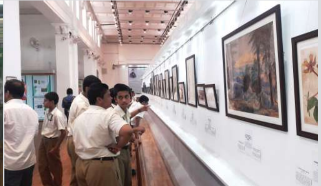
School students from Dum Dum Kishore Bharati High School at J.D. Hooker exhibition