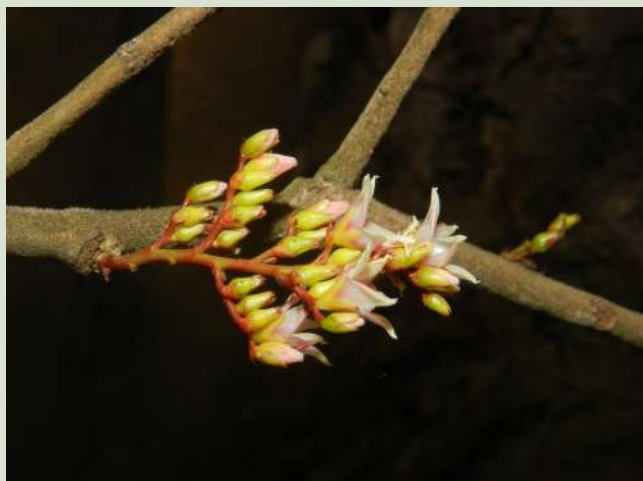
Hopea ponga (Gentianaceae)