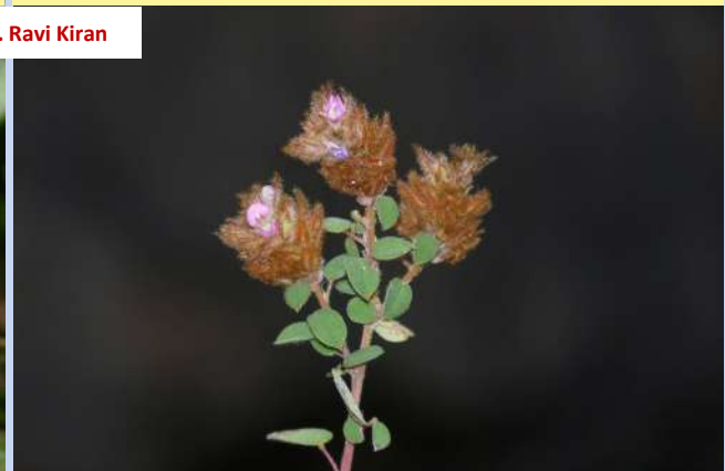
Leptodesmia congesta (Fabaceae)