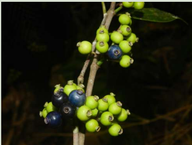
Memecylon rivulare (Melastomataceae)