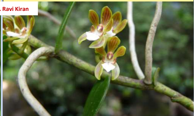
Trichoglottis tenera (Orchidaceae)