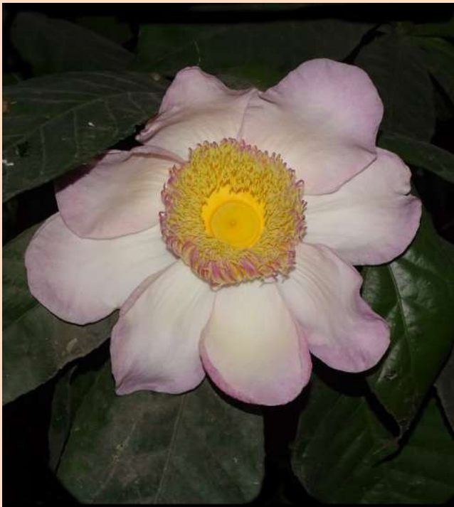
Gustavia augusta L. (Lecythidaceae), commonly known as Majestic Heaven Lotus, small tree with delicate fragrant flowers. Native to South America, cultivated in Botanical gardens as ornamental tree. Its wood is used in building construction.