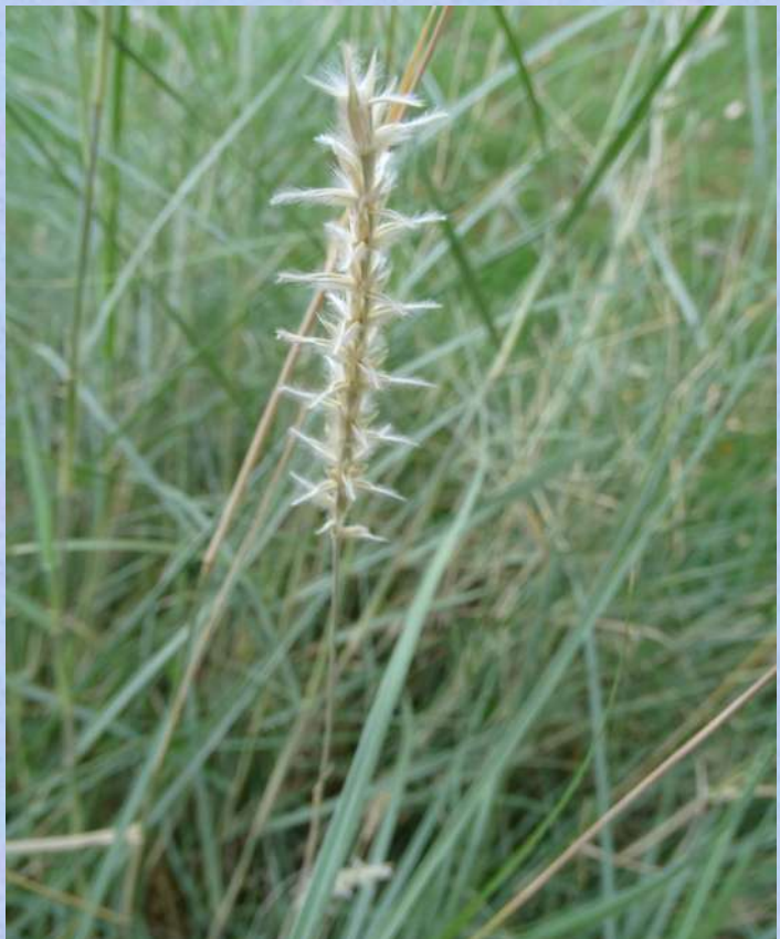
Lasiurus scindicus (Poaceae)