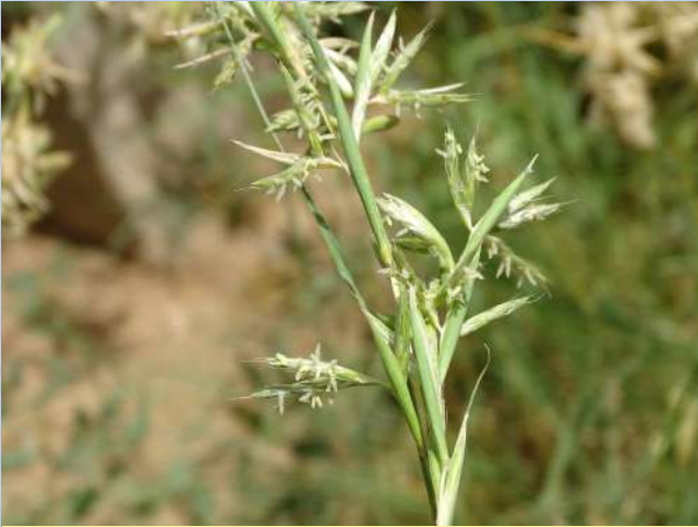
Cymbopogon jwarancusa (Poaceae) in AZRC garden