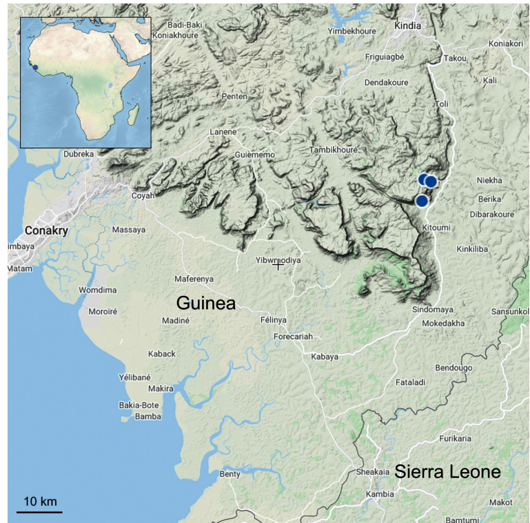
Fig. 5. Distribution of Benna alternifolia , blue dots. Map data © Google 2021.

Distribution — Benna alternifolia is endemic to Guinea (Fig. 5) and occurs in Forécariah Prefecture near border with Kindia Prefecture, in canyons of the Benna Plateau near villages Dalonia and Gombokori.