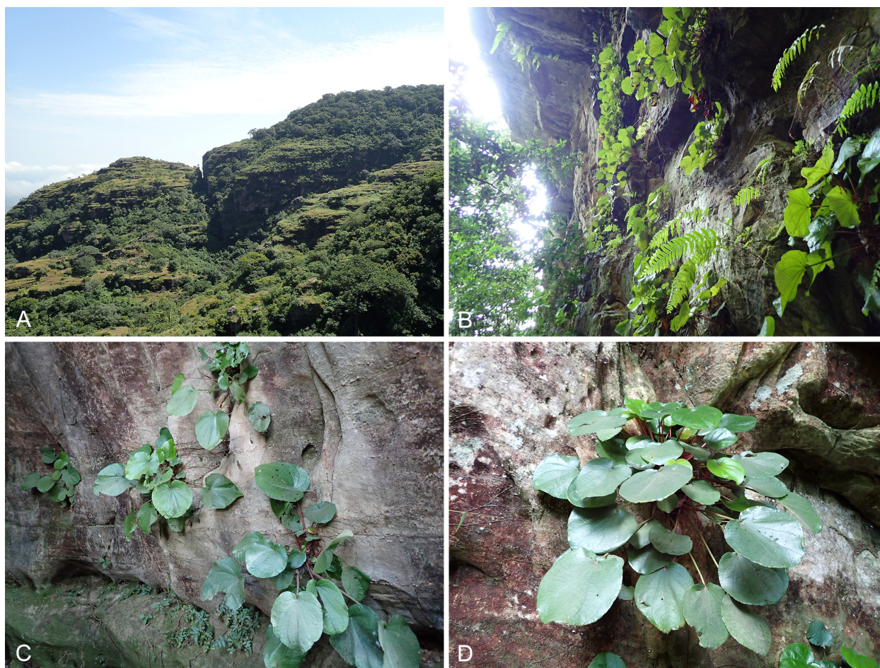
Fig. 3. Benna alternifolia – A: the largest population was found in a deep canyon, of which the upper part is visible at the centre of the photograph, on a 1040 m-high hill on the Benna Plateau; B: plants in their habitat, on vertical rock in deep shade, under overhanging rocks, out of reach of falling rain drops, but within reach of permanently seeping water; C: group of four plants; D: single plant. – Origin: A, C from Burgt & al. 2274 (type gathering); B from Burgt & al. 2323; D from Burgt & Haba 2333.

the other African (including Madagascan) Sonerileae genera (Fig. 1), all of which were sampled in the present study. They are weakly supported (BS 57%) as sister to the South American genus Phainantha . Of the six currently accepted American Sonerileae genera, only three genera were sampled in the present study.