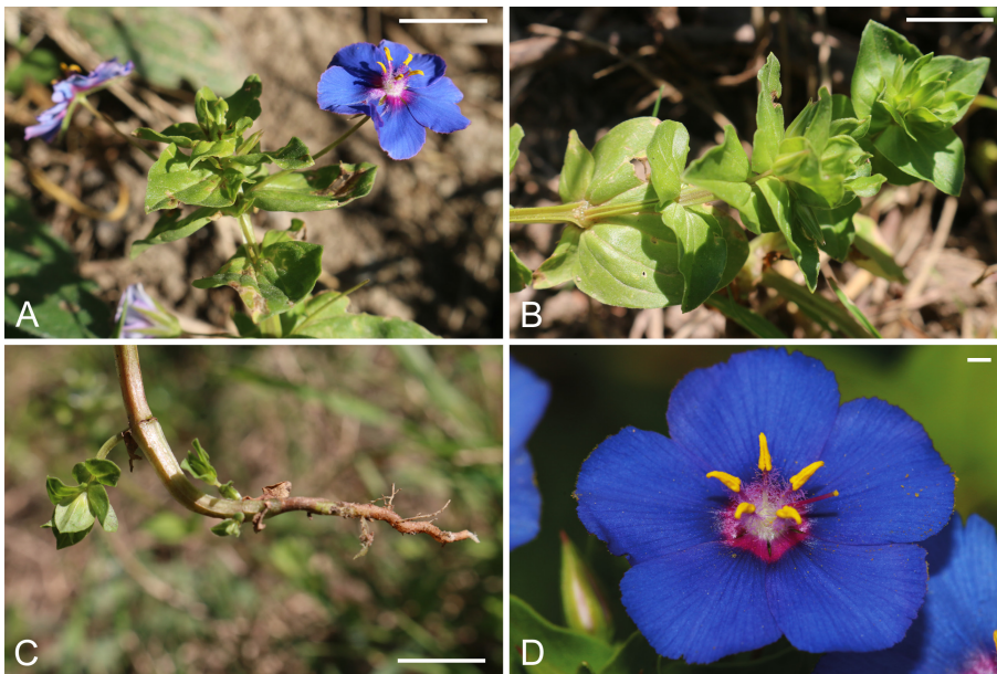
Fig. 6. Lysimachia arvensis subsp. platyphylla – A: general view of inflorescence; B: detail of stem with leaves; C: root detail; D: flower detail. – Scale bars: A–C = 1 cm; D = 1 mm. – A–C: Algeria, Boumerdes, Reghaïa lake, 24 Feb 2020; D: Algeria, El Tarf, Douar Guergour, 29 Apr 2016, photographs by E. Véla.

In conclusion, Lysimachia arvensis subsp. platyphylla represents a discrete taxon, with its sub-specific rank awaiting kary-