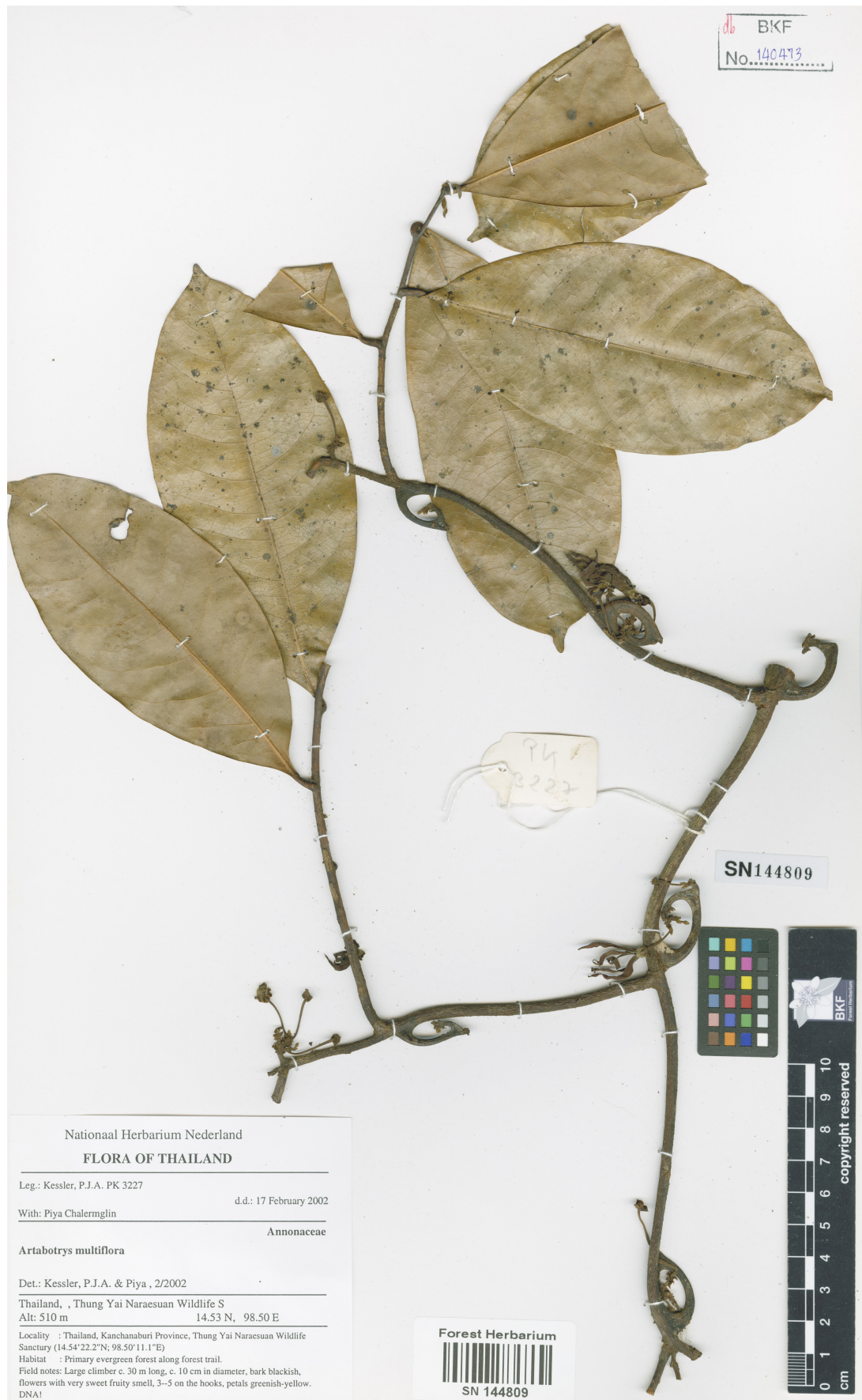
Fig. 3. Holotype of Artabotrys angustipetalus Photikwan & Chaowasku – Kessler PK 3227 (BKF [SN144809]).