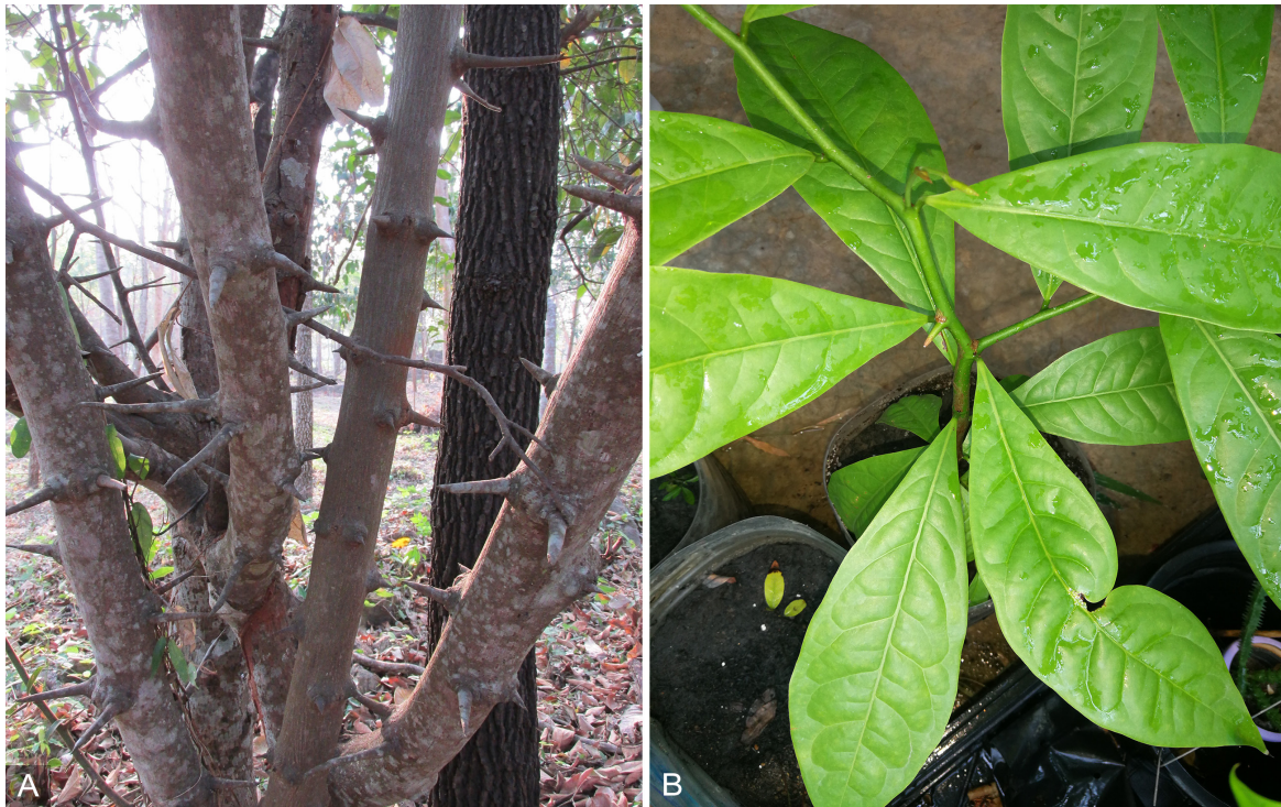
Fig. 6. Thorns of Artabotrys species. – A: pairs of thorns at lower part of stems of A. siamensis [= A. siamensis -1]; B: thorn as a second plagiotropic branch of a sapling of Artabotrys sp.

tionally, as demonstrated by Fisher & al. (2002), light plays an important role for thorn development in A. hexapetalus , i.e. the more shaded the areas, the more thorns are developed. It seems that there is more driving force for plants in shaded areas to grow orthotropic branches up above to reach light and find support from other plants. Therefore, the growth of the less necessary plagiotropic branches is possibly minimized by developing more thorns instead. The orthotropic branches of the thorn-bearing species of Artabotrys can grow very fast and at some point after they reach other plants, fewer thorns but more plagiotropic branches with hooks are developed (personal observations). Regarding thorns in a few species of Annona , mentioned above, further ontogenetic study is indispensable to ascertain if they are homologous with thorns in Artabotrys species because the branching architecture of Annona is distichous, without the distinction between orthotropic and plagiotropic branches, whereas the branching architecture of Artabotrys is spiral, with the distinction between orthotropic and plagiotropic branches (Johnson 2003).