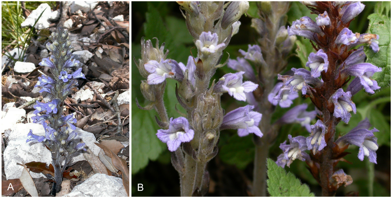
Fig. 7 Phelipanche gussoneana – A: habit of plant; B: inflorescence detail. – Italy, Sicily: Palermo, Rocca Busambra (type locality of Phelypaea gussoneana ), 20 Jun 2014, photographs by G. Domina.

panche schultzioides , including its type, and specimens from Sicily identified as Phelipanche oxyloba (Reut.) Soják (Domina & al. 2011) match Phelypaea gussoneana , including its type. For reasons of nomenclatural priority, the present new combination is necessary when Phelipanche schultzioides and Phelypaea gussoneana are regarded as conspecific. This taxon is typically taller than the morphologically similar Phelipanche mutellii (F. W. Schultz) Pomel and has a different appearance, with bracts sticking out from the inflorescence in bud, and dark bluish veins on the corolla.