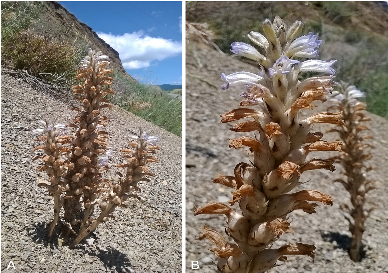
Fig. 8. Phelipanche kelleri – A: habit in late flowering and early fruiting stage; B: detail, upper part of inflorescence. – Georgia: Sarkinetis Kedi, 11 May 2017, photographs by A. Gröger.

Phelipanche orientalis (Beck) Soják (≡ Orobanche orientalis Beck). – Fig. 9.