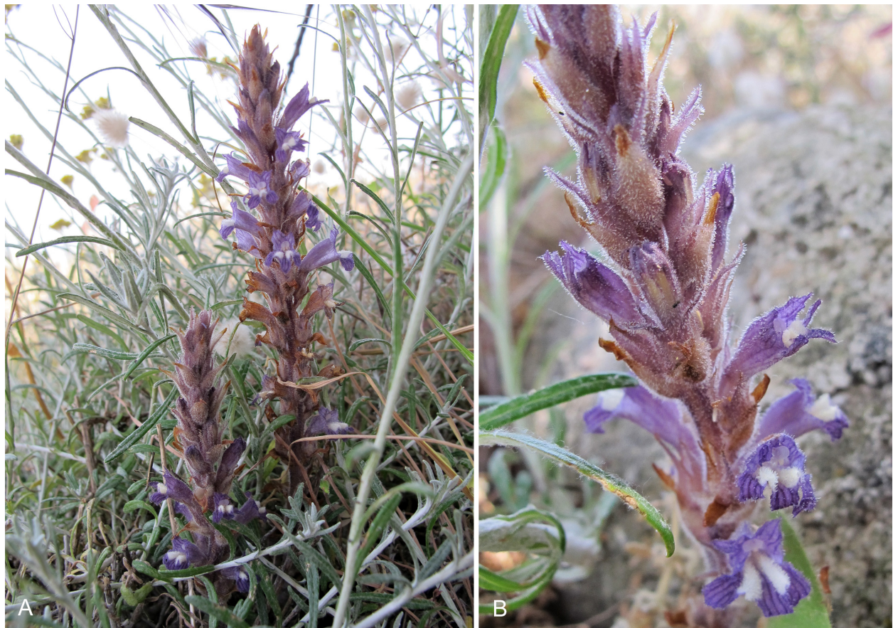
Fig. 9. Phelipanche orientalis – A: habit of plants, B: inflorescence detail. – Greece: Rodos, near Agios Isidoros, 26 May 2014, photographs by S. Rätzl.

1986: 448). Meikle (1985: 1237) gave as host for the plants from Cyprus “ Prunus dulcis , Medicago spec. , Astragalus lusitanicus , etc.” Phelipanche orientalis can also be very abundant in plantations of Prunus armeniaca L. (apricot), e.g. in Turkey, prov. Malatya, 2013, Aksoy & Pekcan, as Phelipanche aegyptiaca (Pers.) Pomel (photo [Aksoy & Pekcan 2014: 31]). The species probably occurs also on other members of Prunus sect. Amygdalus , but has been misidentified (Schiman-Czeika 1964: 1ff.; Musselmann 1980: 463ff.; Riches & Parker 1995: 226ff.; Saeidi Mehrvarz & al. 2010: 113; Sánchez Pedraja & al. 2016+).