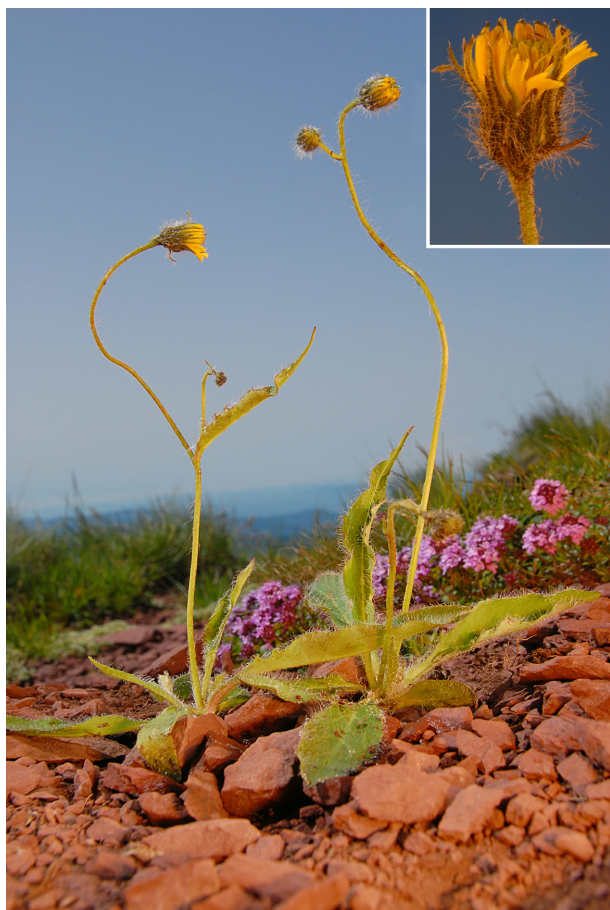
Fig. 4. Hieracium schmidtii subsp. balkanum – Serbia: Stara Planina, Žarkova Čuka (7–8 km from type locality), 5 Jul 2014, photographs by M. Niketić.