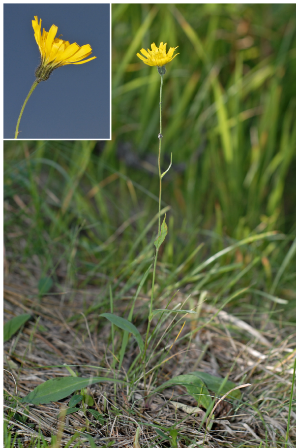
Fig. 5. Hieracium stenoglossophyllum – Serbia: Šar Planina, Ošljak, 30 Jul 2008, photographs by M. Niketić.

H. sparsum subsp. naegelianiforme O. Behr & al., from which it is distinguished by its (almost) glabrous peduncles. Š. Duraki & M. Niketić