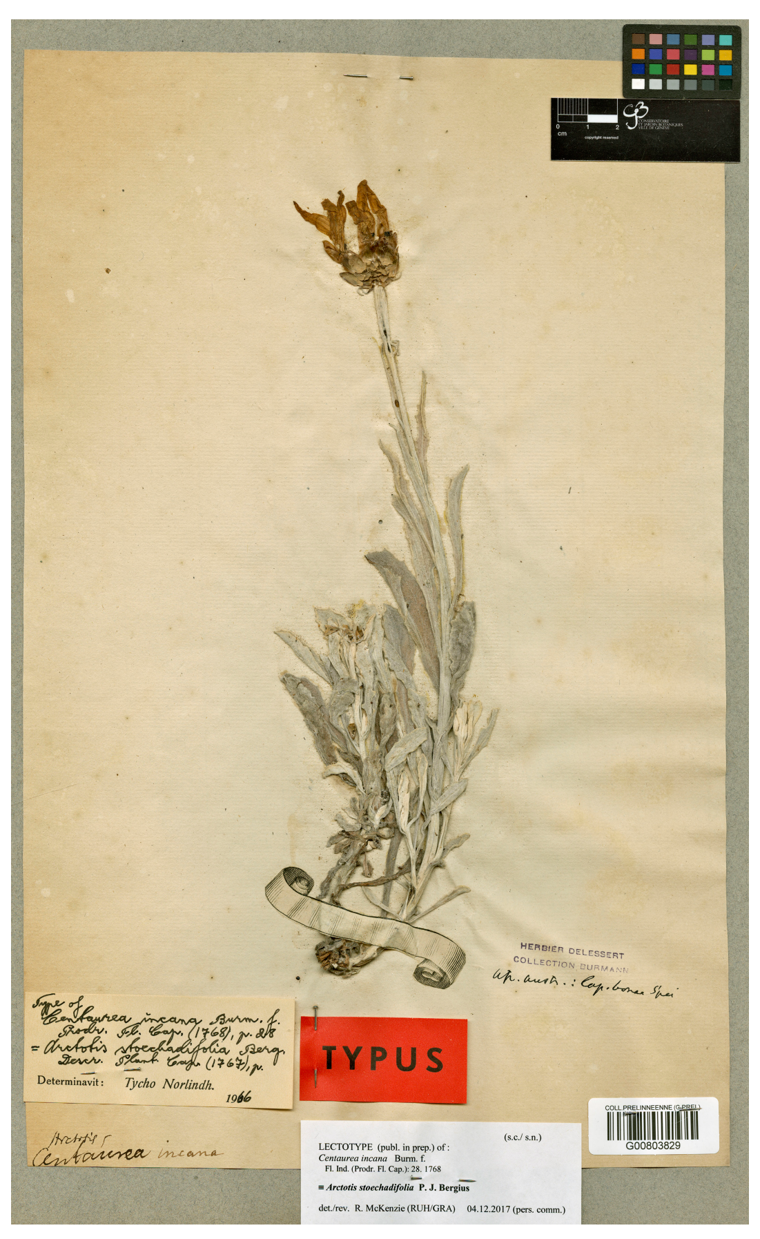
Fig. 3. Lectotype of Centaurea incana Burm. f. ( \equiv Arctotis stoechadifolia P. J. Bergius) (G-PREL 00803829).