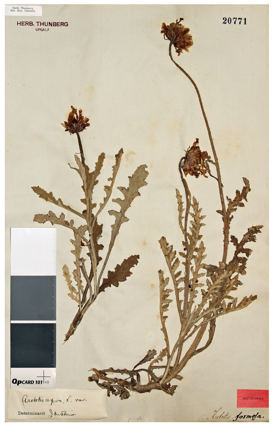
Fig. 2. Lectotype of Arctotis formosa Thunb. (UPS-THUNB 20771).