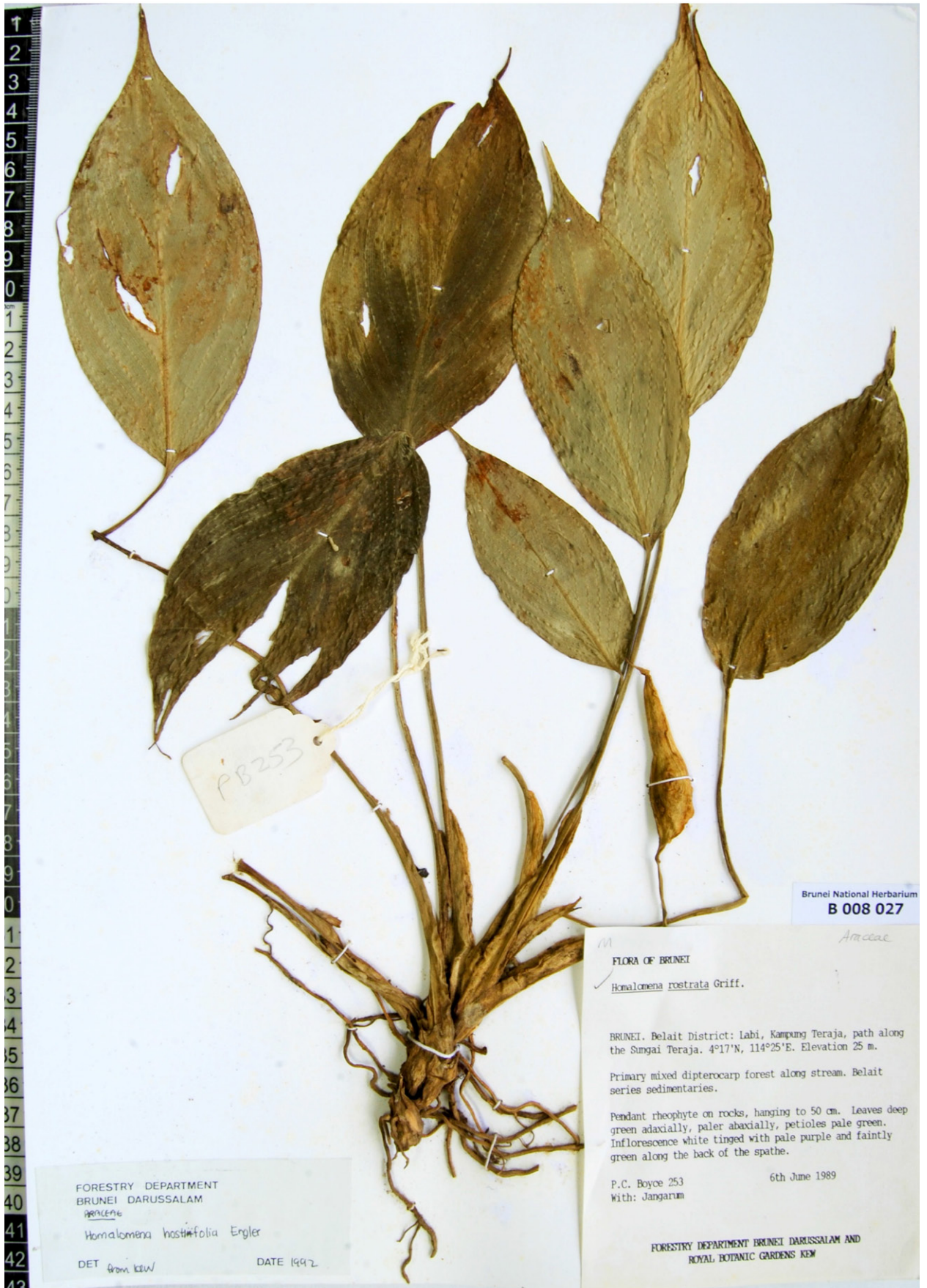
Fig. 3. Homalomena scutata – holotype specimen: P. C. Boyce 253 (BRUN – B 008 027).