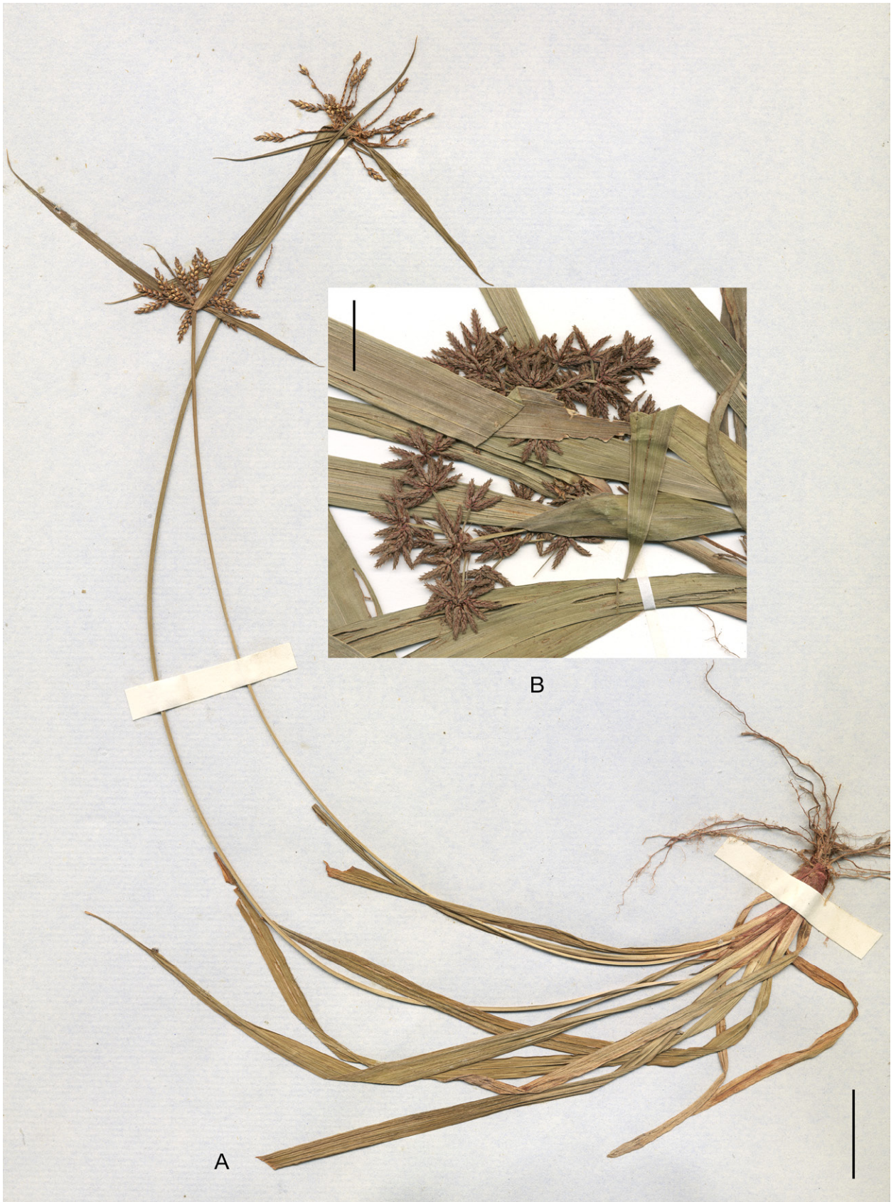
Fig. 2. Cyperus lacustris – A: representative specimen, R. Spruce s.n. (E 153064) from Pará, Brazil. – Cyperus miliifolius – B (inset): detail of representative specimen showing leaves, bracts and inflorescence, L. Holm-Nielsen & al. 19880 (EIU) from Ecuador. – Scale bars: A & B = 2 cm.