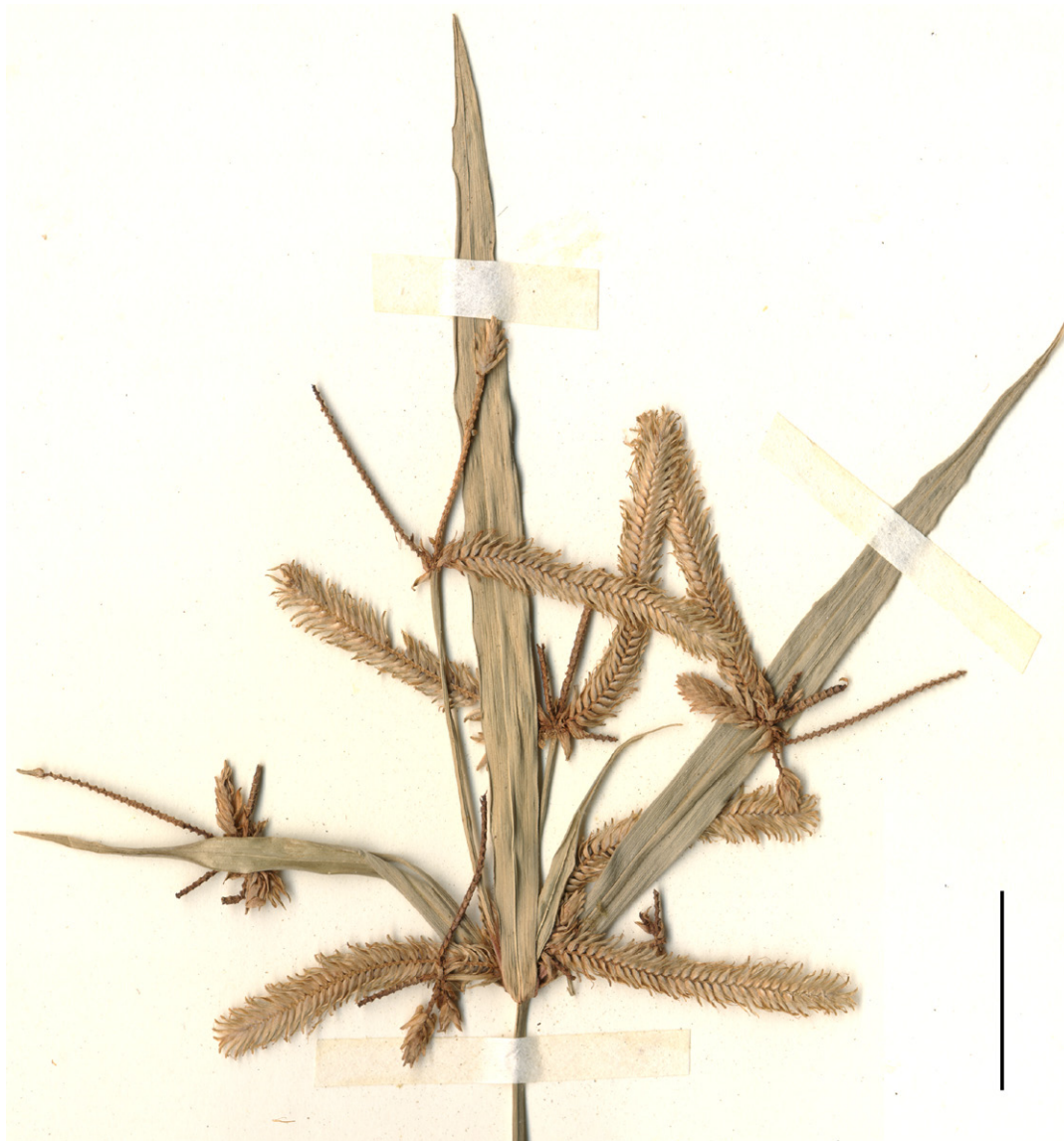
Fig. 3. Cyperus altsonii – close-up of inflorescence, J. Florschütz & P. A. Florschütz 1414 (U) from Suriname. – Scale bar = 2 cm.

SURINAME: Suriname River at Goddo, 26 Jan 1926, Exp. ped. Wilhelmina-Gebergte 99 (U [2 sheets]); Van Asch Van Wijcks Mountains, near Ebba Top base, 14 Feb 1951, J. Florschütz & P. A. Florschütz 1414 (U [Fig. 3]).