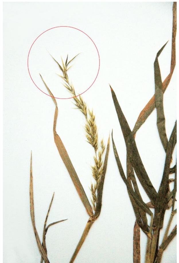
Fig. 4. Trisetum tamonanteae – panicle with a proliferated spikelet (‘‘plantlet’’), as a possible pseudoviviparous mechanism. – Paratype: A. Marrero (LPA 24805).

In the Poaceae pseudoviviparism has been recorded for at least 41 species in 13 genera (Pierce & al. 2003). It has been described for genera such as Dactylis L., Deschampsia P. Beauv., Digitaria Haller, Festuca L., Poa L., and Polypogon Desf., among others (Vega & Rúgolo de Agrasar 2006). The pseudoviviparism mechanism is generally associated with boreal or alpine species exposed to strong stress in nutrient-poor habitats (Elmqvist & Cox 1996; Pierce & al. 2003). The possible tendency to vegetative propagation by pseudoviviparism in T. tamonanteae