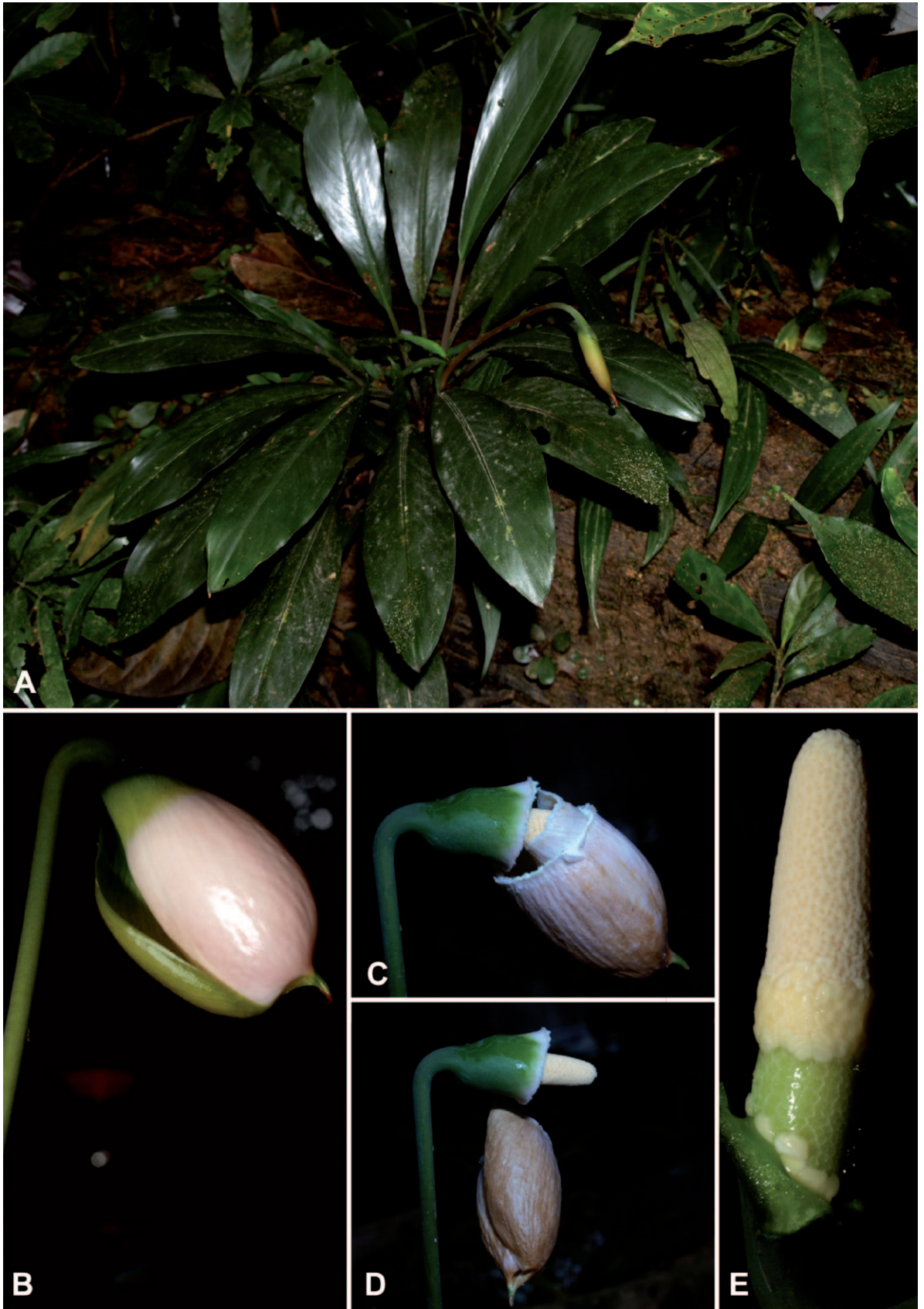
Fig. 2. Piptospatha burbidgei – A: flowering plant in habitat, on shales, Mulu N. P., N. Sarawak; B: inflorescence at pistillate anthesis; C: inflorescence at onset of staminate anthesis. Note that the spathe limb has begun to senesce and has partly separated from the lower, persistent spathe; D: inflorescence towards end of staminate anthesis; E: spadix (spathe artificially removed) at pistillate anthesis. – Photographs from P. C. Boyce & al. AR-1973 by P. C. Boyce.