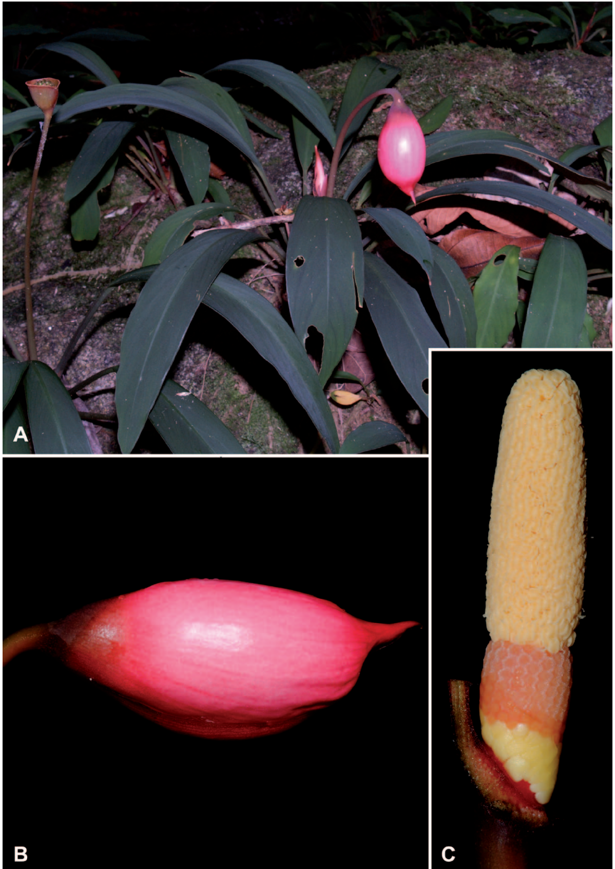
Fig. 3. Piptospatha elongata – A: flowering plant in habitat on granite, Gunung Gading N. P., NW Sarawak; B: inflorescence at onset of pistillate anthesis; C: spadix at staminate anthesis with spathe artificially removed, note the absence of a zone of staminodes between the pistillate and staminate zones and the conspicuous zone of staminodes below the pistillate zone. – Photographs A from P. C. Boyce & al. AR-2052, B–C from P. C. Boyce & al. AR-3601, all by P. C. Boyce.