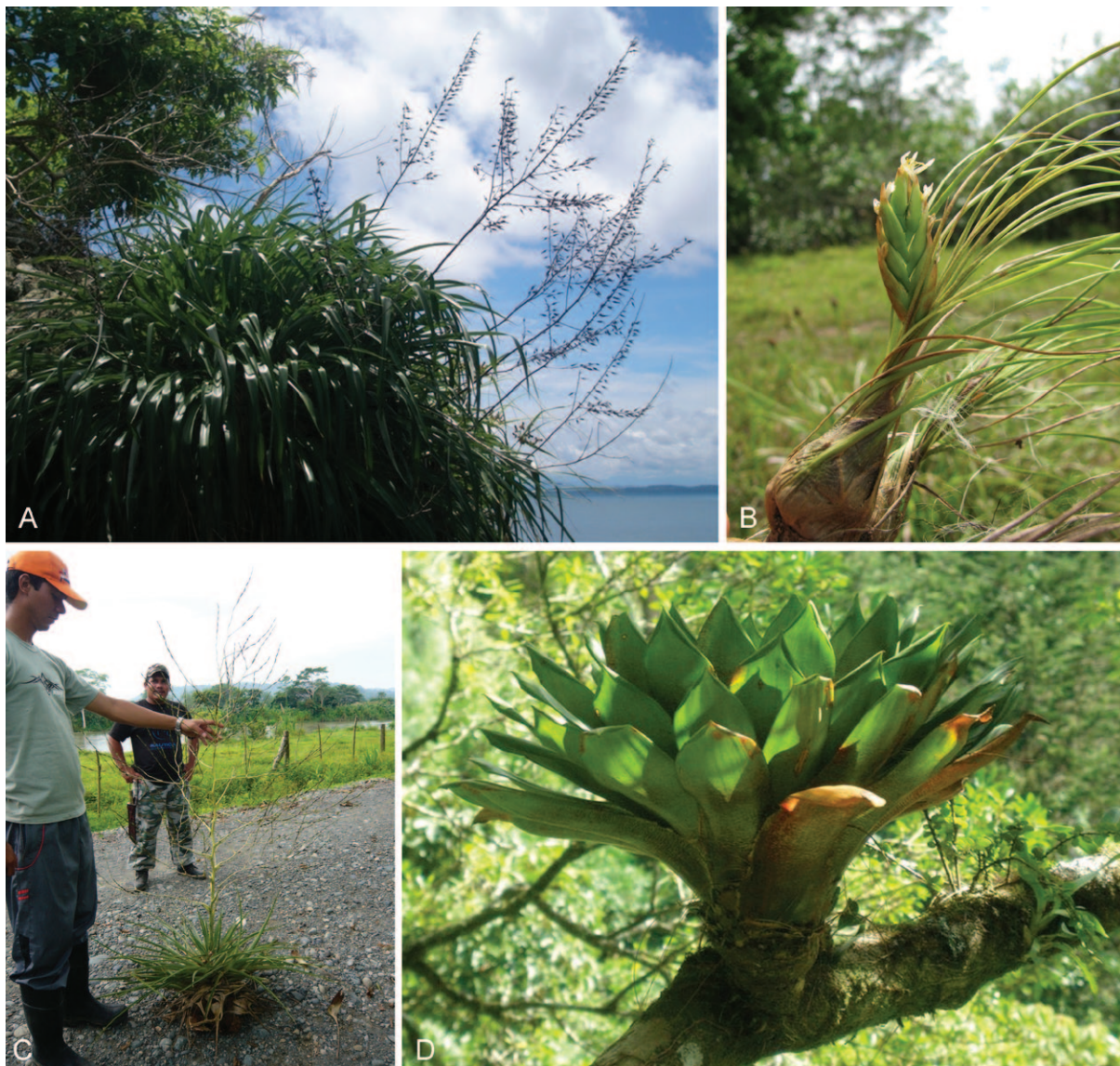
Fig. 2. A: Pitcairnia halophila, Gulf of Chiriqui Marine National Park, Paridas Islands; B: Tillandsia dexteri, Remedios Distr.; C: T. utriculata, Changuinola Distr., after the community of El Silencio; D: Werauhia paniculata, Boquete Distr., El Pianista Trail to Culebra.