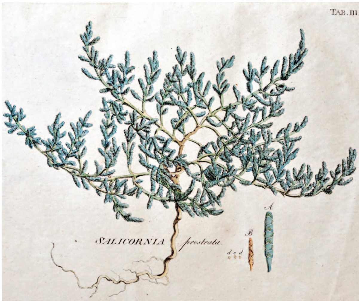
Fig. 2. Illustration of Salicornia prostrata Pall. (Pallas 1803: t. 3).

(1995), Tzvelev (1996) and Sukhorukov (2006) agree that the diploid populations in SE Russia and W Kazakhstan, which generally can be separated from the tetraploids by the smaller anthers (0.25–4 mm), shorter spikes (up to 3–4 cm) and thinner central cylinders (König 1960), belong to one species. It is named Salicornia herbacea , S. europaea , S. prostrata or S. perennans , with the first and the third name being synonyms. Only Pallas (1803) recognised three species, raising his S. herbacea var. \beta to species rank as S. prostrata , re-naming the erect growing plants as S. acetaria and describing the new species S. pygmaea . However, the last species was later recombined as Halopeplis pygmaea (Pall.) Bunge ex Ung.-Sternb. As far as is known to us, Salicornia was never critically studied in the area under review. Therefore, our observations about the variability of Salicornia gained during an expedition also aimed at studying the annual salt-marsh communities of the Caspian lowlands in 1996 (Freitag & al. 2001: 70–71), merit some discussion.