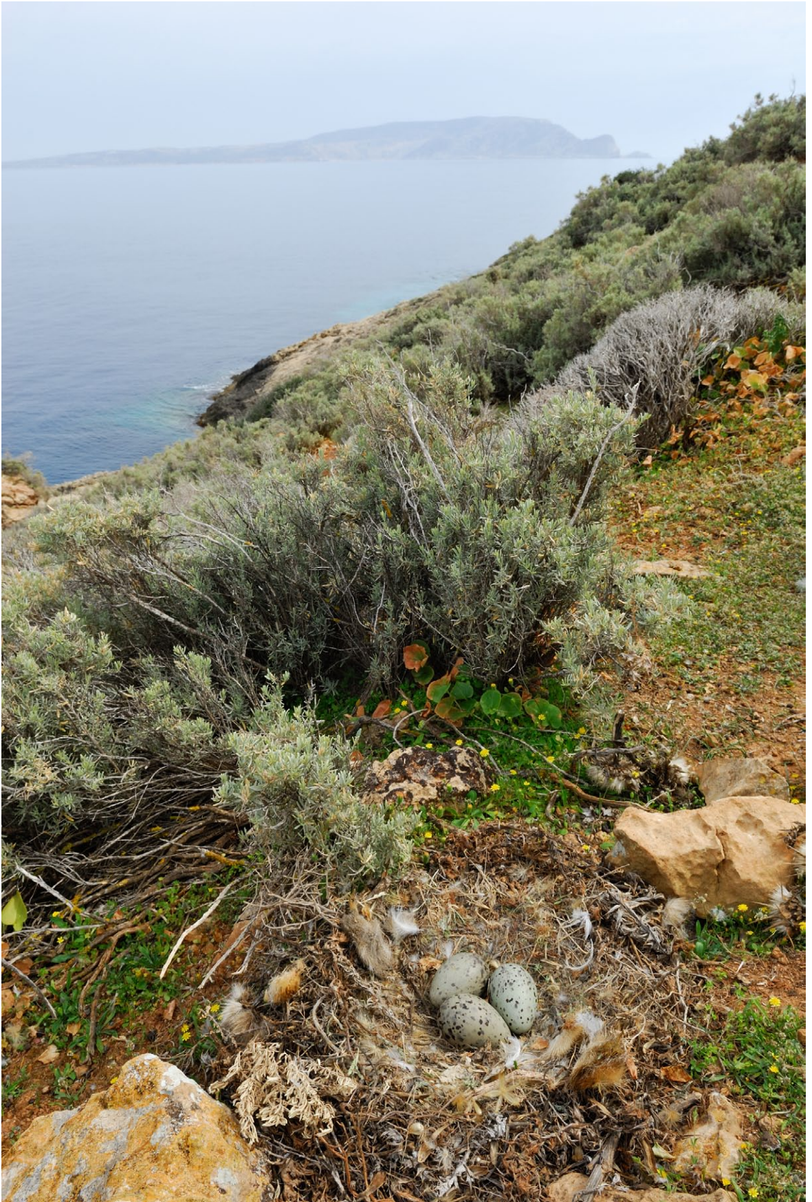
Fig. 3. Halo-nitrophytic scrub with Atriplex mollis on Gavdopoula in its single European locality, with gull's nest ( Larus michahellis michahellis ). – Photo by N. Turland, April 2009.