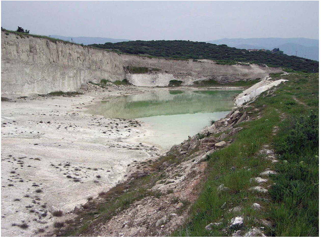
Fig. 3. Habitat of Puccinellia bilykiana in Greece.

– Gramen perenne dense caespitosum compactum. Culmi tenues geniculato-ascendentes 5–10 cm alti. Paniculae valde contractae, 8–12×3–5 mm metientes. Spiculae 3–3.5 mm longae, 3–4-florae; rhachilla scaberula; glumae late ovatae, c. 2 mm longae, subaequales; lemmata 2.5 mm longa, inferne appresse pilosa. Antherae c. 1 mm longae.