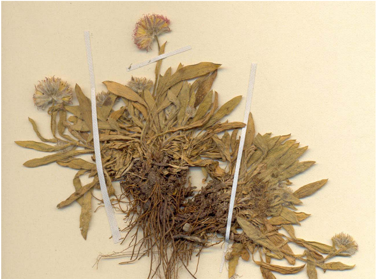
Fig. 1. Erigeron uniflorus subsp. parnassensis , holotype specimen.

nal collectors (C. D. Preston, pers. comm., 2007), there is no suggestion that the plants were collected from an unusual habitat or substrate, where conditions of stress might induce phenotypic modification.