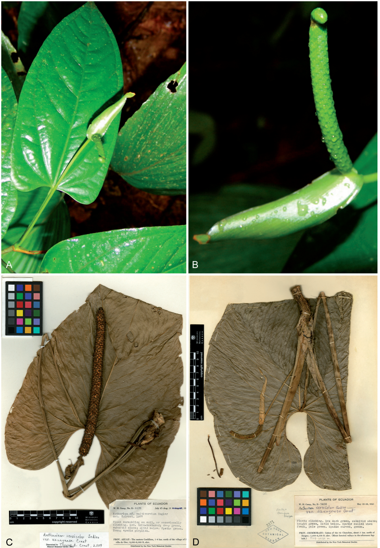
Fig. 3. A–B: Anthurium patens – leaf blade, adaxial surface and inflorescence (A); inflorescence, close-up (B); C–D: A. versicolor var. azuayense – type specimen, Camp E-4435 ; D: paratype specimen, Camp E-3406 .