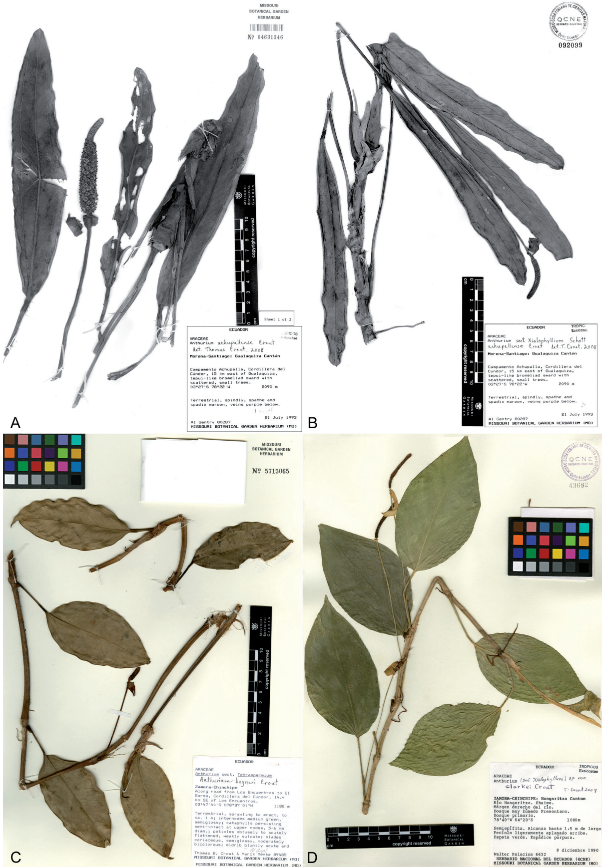
Fig. 1. A–B: Anthurium achupallense – holotype specimen at MO, Gentry 80287 (A), isotype specimen at QCNE (B); C: A. bogneri – holotype specimen at MO, Croat & Menke 89485; D: A. clarkei – isotype specimen at QCNE, Palacios 6632.