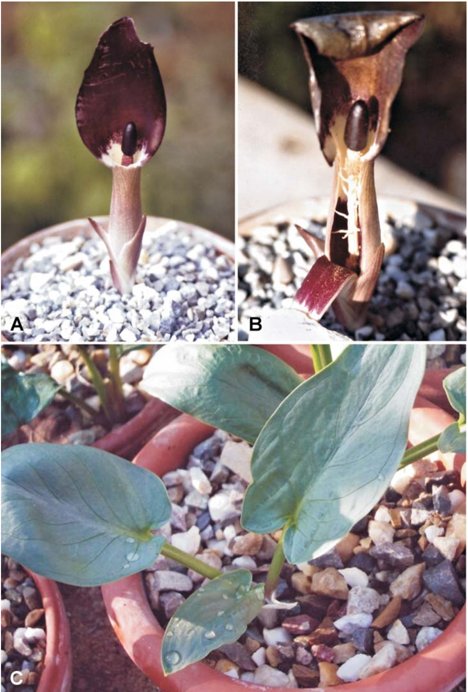
Fig. 2. Eminium jaegeri – A: flowering in cultivation, note the apex of the spathe still being erect; B: inflorescence, tube of spathe opened to show the sterile flowers between the female and male flowers; C: cultivated plant with leaves. – Photographs by M. Jaeger.