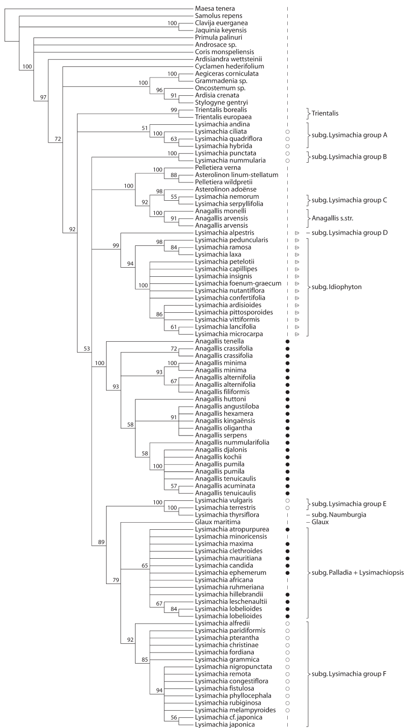
Fig. 1. Jackknife tree obtained from the Xac analysis of ndhF . Jackknife support values (> 50 %) are indicated above the nodes. ○ = Flowers with oil-producing trichomes; ● = flowers with nectar-producing trichomes.