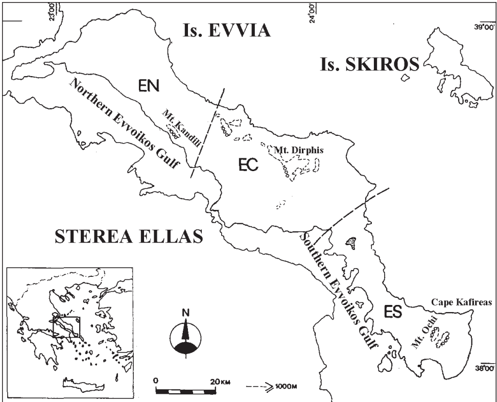
Fig. 1. Topographic map of Evvia with the northern (EN), central (EC) and southern (ES) divisions according to Rechingher (1961).