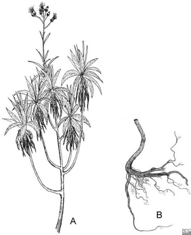
Fig. 2. Ptilostemon greuteri – A: habit; B: roots.