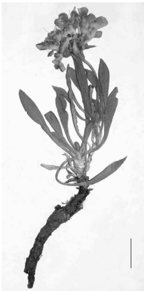
Fig. 1. Lomelosia solymica – specimen Ulrich 4/24a (herb. Parolly). – Scale bar = 1 cm.

(10-)15-35(-40) × 2-6 mm, narrowly obovate to spatulate or oblanceolate, tapering into a narrow base, apex mostly acute, less often mucronulate to obtuse. Stem leaves similar, but smaller in size than rosette leaves, very few, often reduced to bracts. Peduncle 1-2 cm long, c. 0.7 mm in diam., leafless. Capitula solitary, in flower flattened-hemispherical, radiant, (15-)20-25(-30) mm in diam., in fruit globose, 12-17 mm in diam. Involucral bracts 8, in two series, distinctly (3-)5-7-veined outside, variable in shape and density of the indumentum, outer surface thinly to densely pubescent, inner surface often glabrous; outermost bracts green, mainly with paler centres and purplish margins, ovate to ovate-lanceolate, often gibbous in the middle, 4-6 × 2-3 mm, apex apiculate to obtuse; innermost bracts similar but smaller in size, gradually merging into the receptacular bracts. Receptacular bracts white, with purplish or green tips, scale-like, keeled, oblanceolate to narrowly ovate, 3-5 × 1.2-2 mm, herbaceous with a hyaline membranous margin clearly dilated towards the base or only with herbaceous tip and vein, apex ± rounded, hairs as in involucral bracts but thinner. Florets 14-20, pale mauve, lilac to pinkish, the outer strongly radiant, 11-13 mm long. Corolla with a narrowly infundibuliform, white-lanate tube, c. 4.5-7 mm