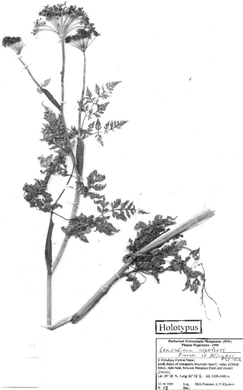
Fig. 11. Conioselinum nepalense – upper part of the holotype.