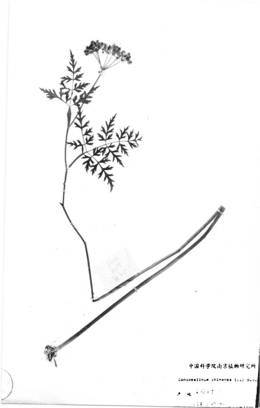
Fig. 13. Conioselinum shanii – holotype.