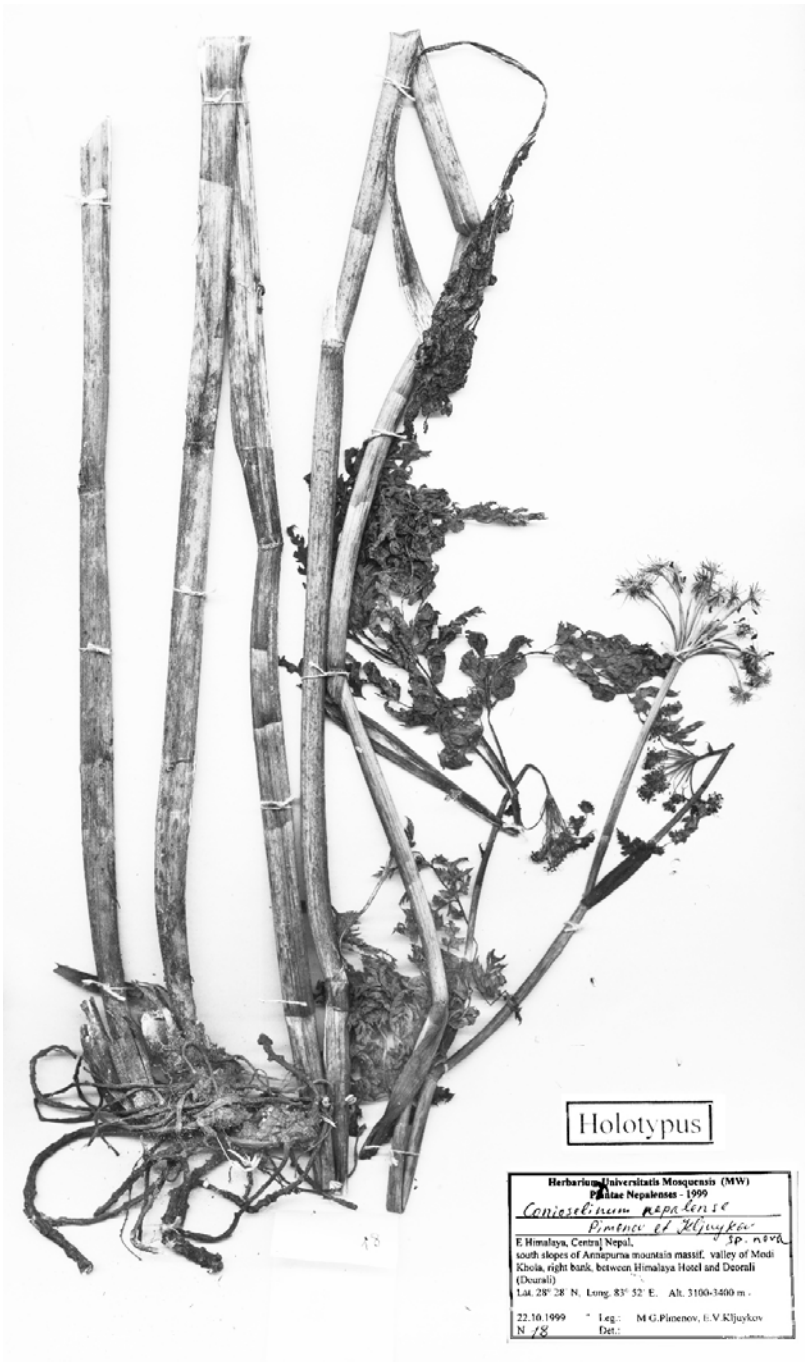
Fig. 10. Conioselinum nepalense – basal part of the holotype.