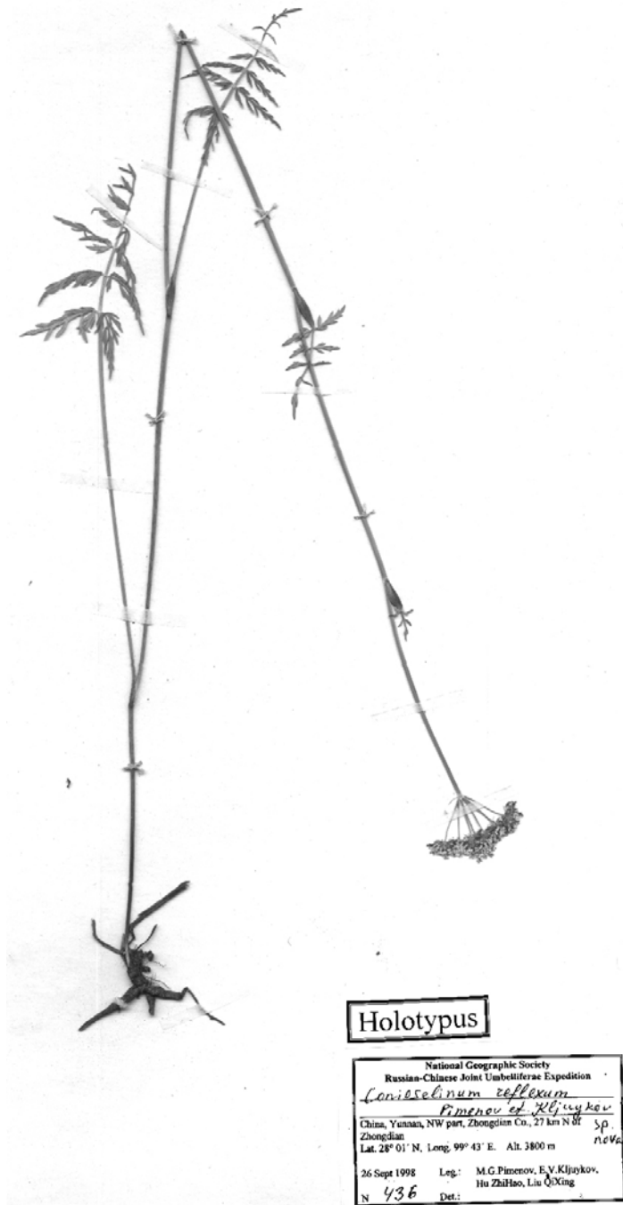
Fig. 12. Conioselinum reflexum – holotype.