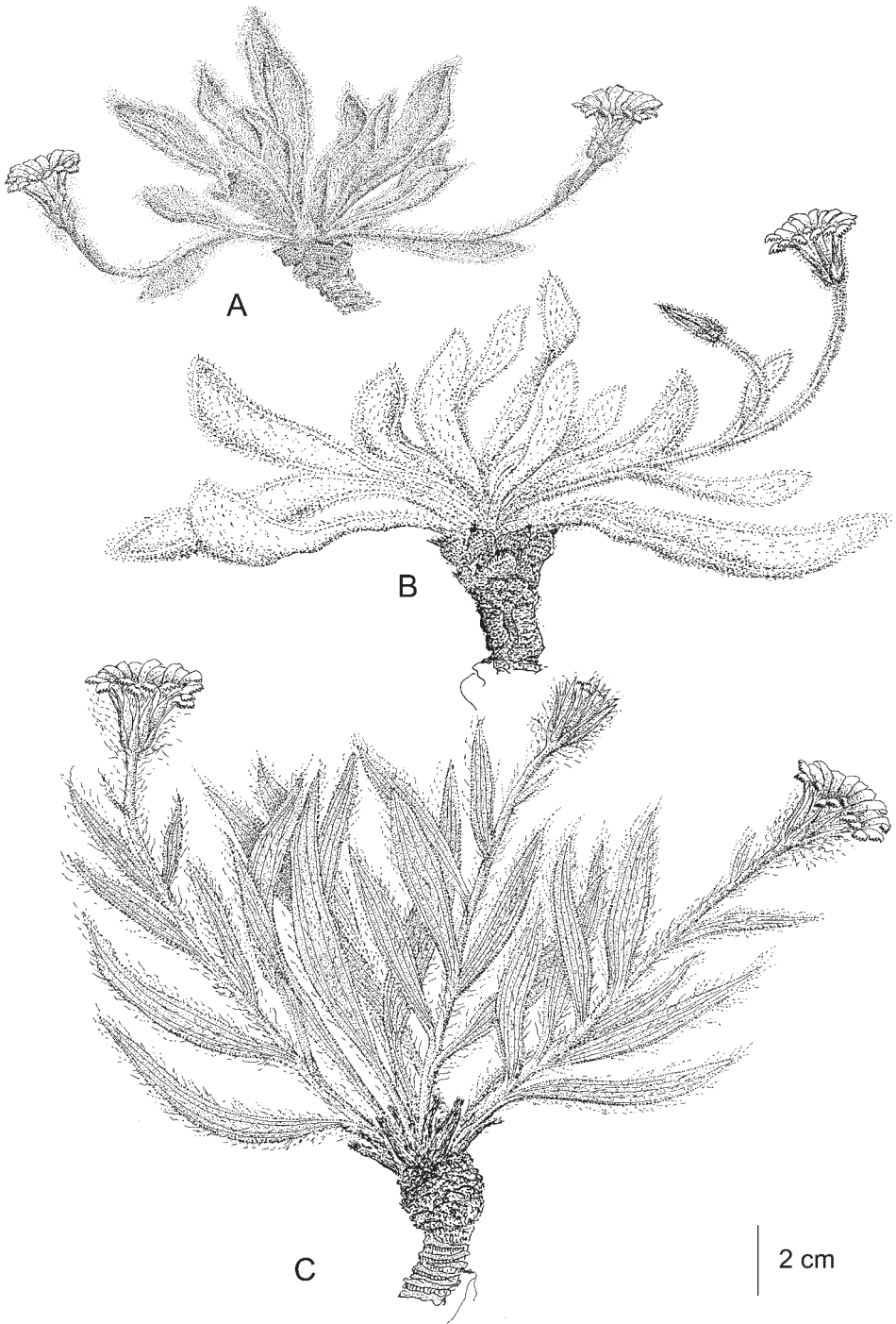
Fig. 2. Scorzonera karabelensis (A), S. ulrichii (B), S. pisidica (C) . – A after R. Ulrich 3/7b, B after R. Ulrich 2/12, C after R. Ulrich 2/22; drawings by Alexander Ehler (BGBM).