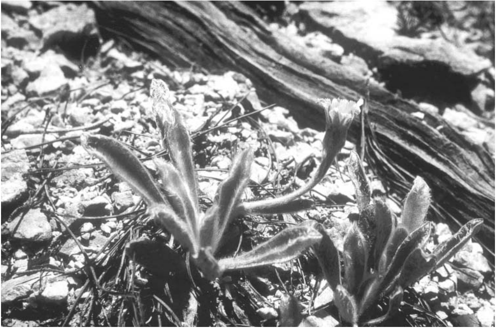
Fig. 1. Scorzonera karabelensis – photograph, from the type locality, by R. Ulrich, 2003.