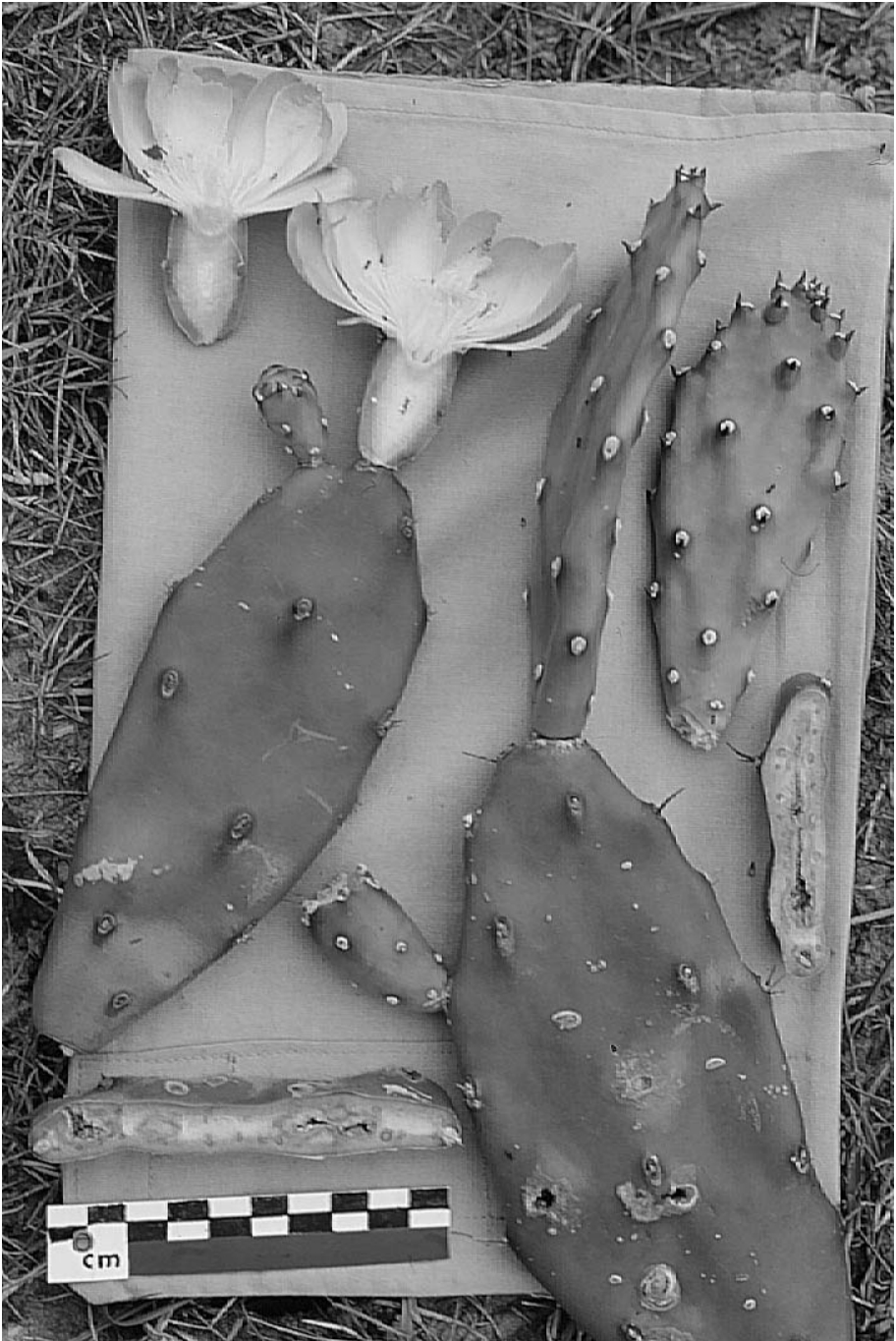
Fig. 2. Opuntia cardiosperma K. Schum. from Corrientes (Argentina), leg. Leuenberger & Arroyo-Leuenberger 4749 , material for the herbarium prior to drying.