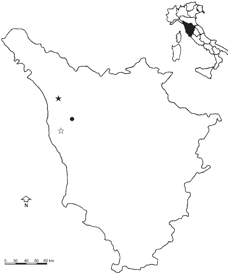
Fig. 3. Present stand of Symphytum tanaicense (black star), of S. officinale 2n=24 (black circle) and past stand of S. tanaicense (white star) in Tuscany, Italy.

(named Tanais in classical times) first collected and subsequently named S. tanaicense by Steven. We have no reasons to doubt Degen's (1930) conclusion that Kerner's S. uliginosum is synonymous with the latter as assumed in the following conclusions, but this question will be further dealt with after a careful analysis of Kerner's type specimen.