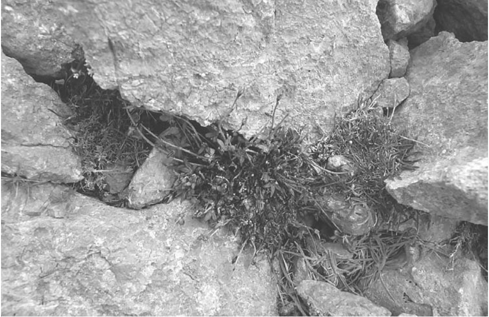
Fig. 3. Asyneuma junceum, with Alopecurus lanatus and Minuartia juniperina on the summit plateau of an unnamed lateral summit N of the Uyluk Tepe, Akdağ, Lycian Akdağları above Gömbe, c. 2900 m.