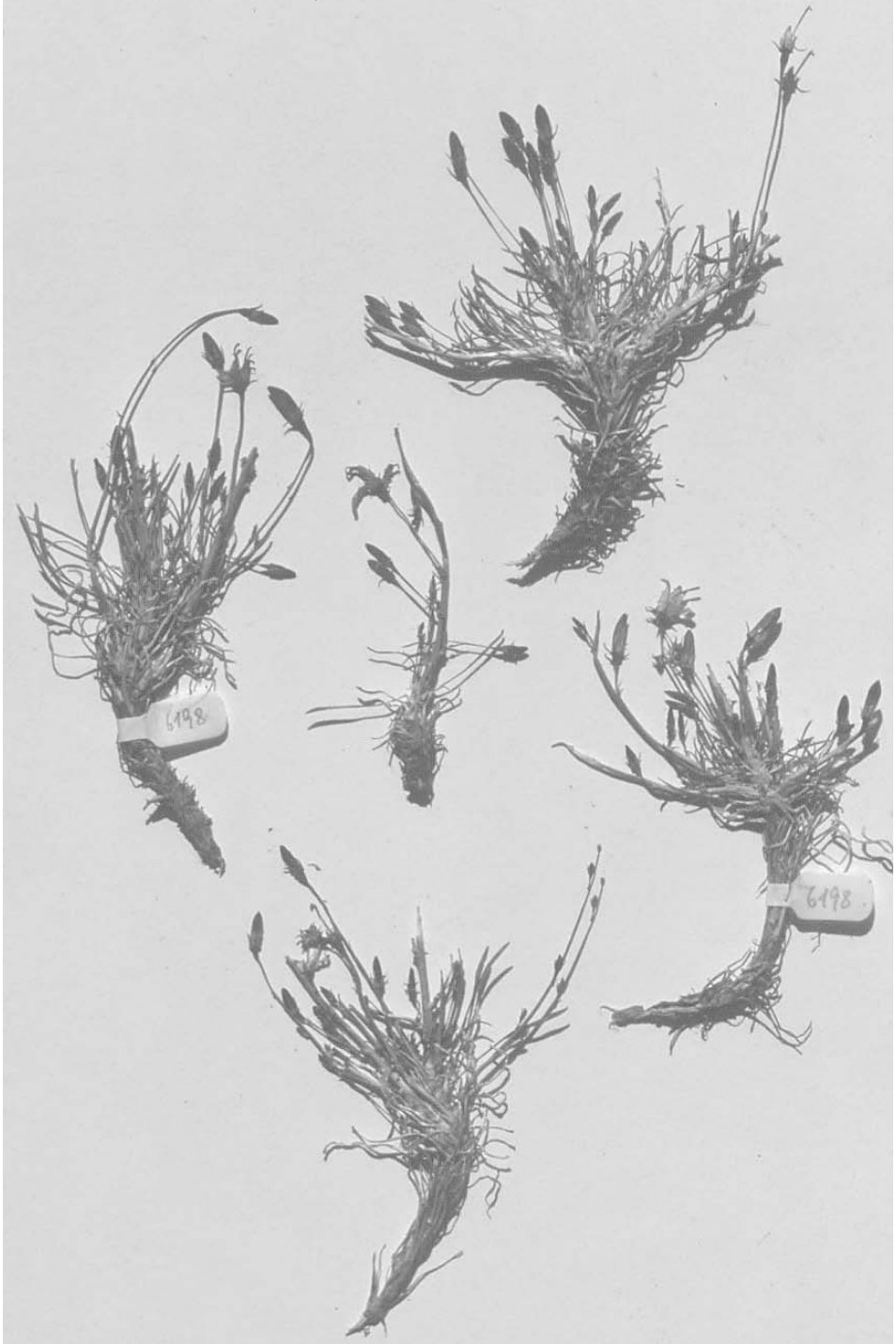
Fig. 2. Asyneuma junceum – Lycian Akdağları above Gömbe, Döring, Parolly 6198 & Tolimir (B).