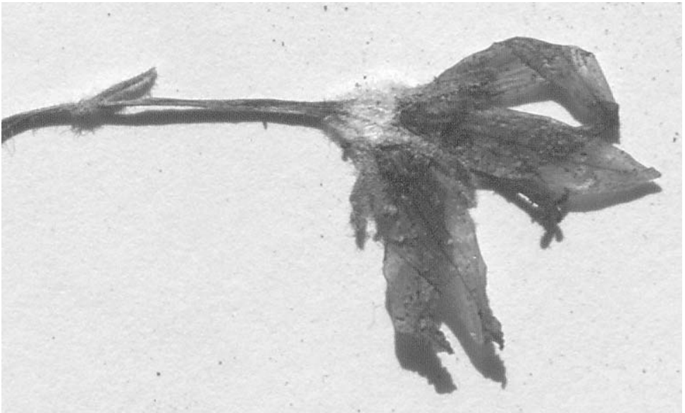
Fig. 5. Asyneuma compactum var. eriocarpum – flower in detail showing the dense lanate-tomentose indumentum of the ovary and calyx. – From the holotype at B.