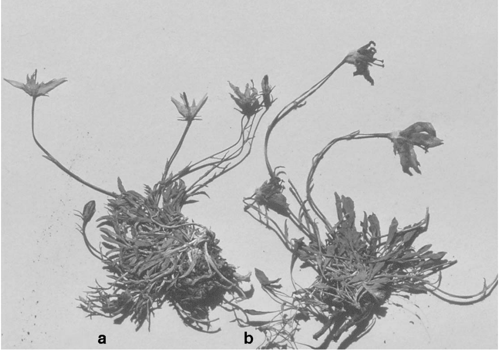
Fig. 4. Asyneuma compactum var. compactum (a, from Döring, Parolly 6661 & Tolimir, herb. Parolly; Dedegöl Dağları) and var. eriocarpum (b, from the holotype at B).