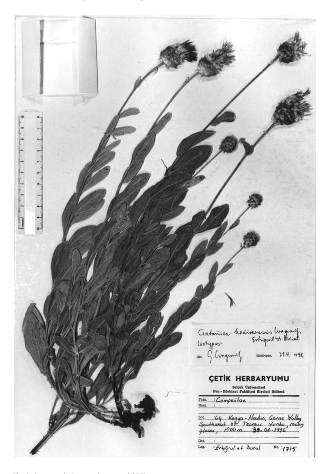
Fig. 1. Centaurea hadimensis (isotype at GOET).