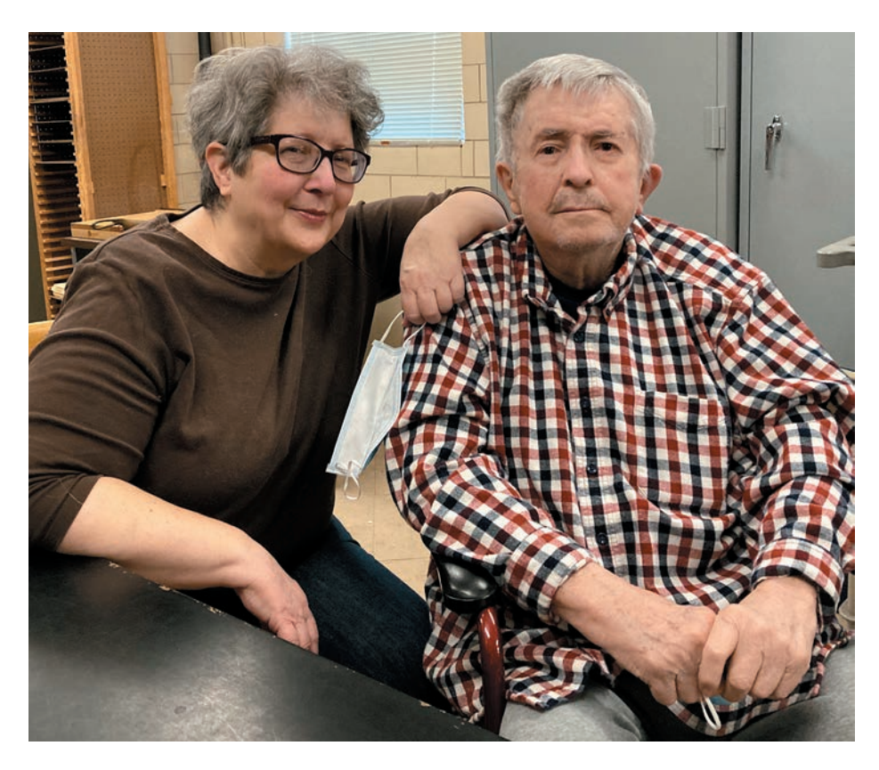
Figure 5. Dr. Wilbur and daughter Margaret Wilbur in the Duke Herbarium, summer 2021.

Regarding plant nomenclature, Wilbur was a stringent rule-follower, and as with other aspects of his botanical work, he was knowledgeable and rigorous. He was not enamored with formal conservation of generic names, and he was uncomfortable with the conservation of species names. He offered one of the few formal classes available then in plant nomenclature, at the graduate level. This was a well-organized pass through the Code of Botanical Nomenclature, as it was then called, which he considered essential for training in plant taxonomy.