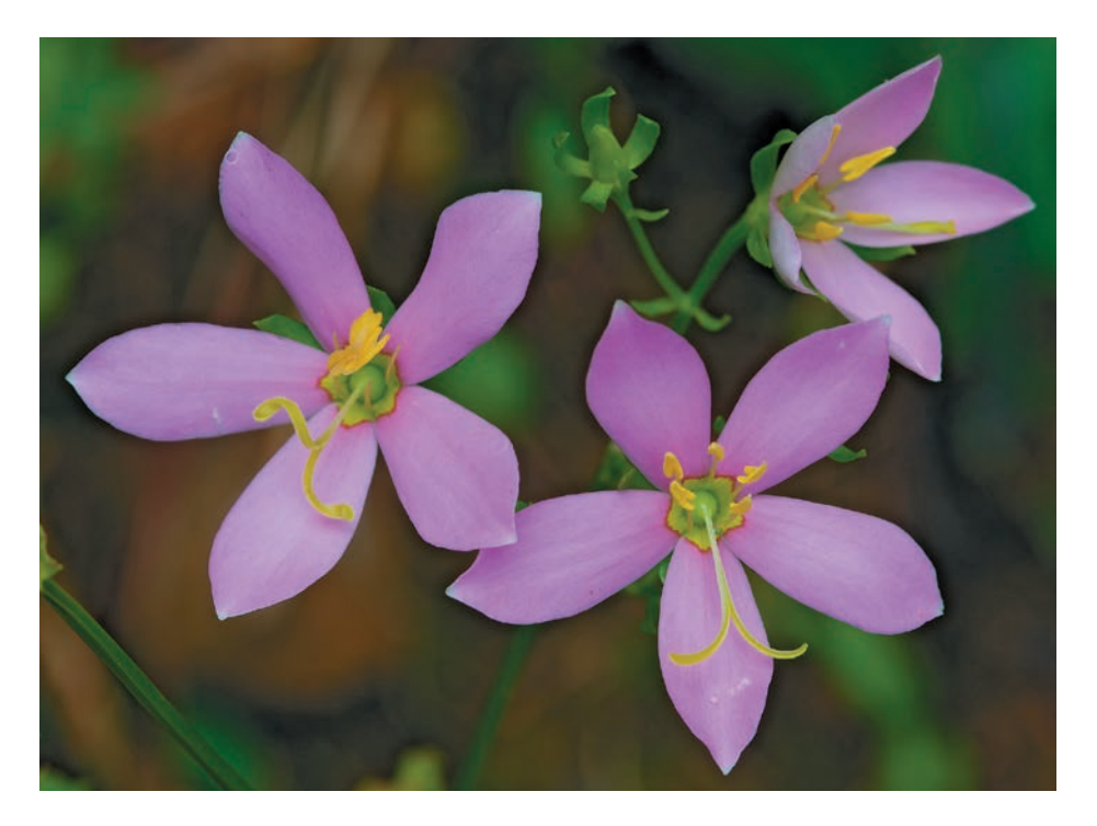
Figure 2. Flower of Sabatia angularis (L.) Pursh. The Gentianaceae were a focus of Dr. Wilbur's work.

1989b) and of the cryptic botanical works of Constantine Rafinesque (1783–1840). Rafinesque studied Sabatia among many other genera, and he left a complicated plant taxonomy for later botanists to tease apart and a large set of names of problematic status under the rules of the current International Code of Nomenclature for algae, fungi, and plants (Turland et al. 2018). Rafinesque has been poorly regarded and heavily criticized as both a person and a taxonomist, and his work interested Wilbur partly because the names presented a complex nomenclatural puzzle with aspects both of botany and southern history, and partly because Wilbur's first reaction was always to stand up for the disregarded Southern underdog—and Rafinesque surely qualified as one.