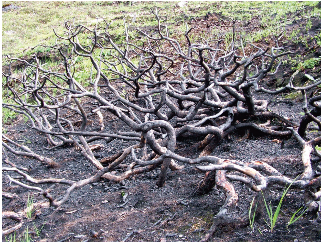
FIGURE 1 Rhododendron shrubs above 4100 m altitude at Soe Yaksa after prescribed burning.

prescribed burning can lead to 4.5 times as much carrying capacity as cutting or no treatment. The estimated carrying capacity after prescribed burning was also higher than the 0.10 livestock unit per hectare previously estimated for high-altitude regions (Dorjee 1986).