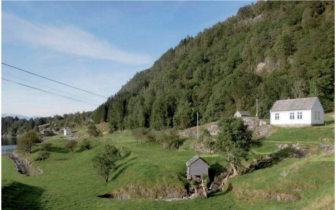
Figure 1. The steep slope with deciduous forest in which Scopelophila ligulata was first found.