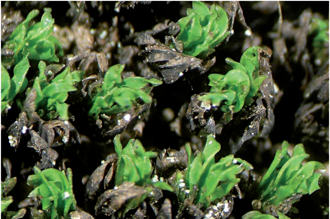
Figure 2. Dry plants of Scopelophila ligulata .