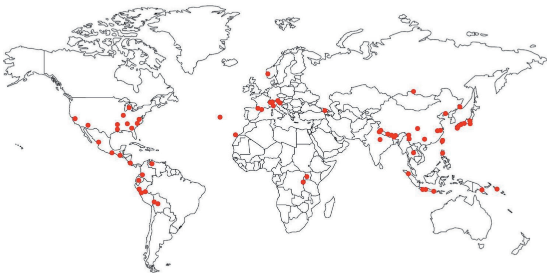
Figure 10. World distribution of Scopelophila ligulata .

Copper mosses have traditionally been considered to be more or less restricted to substrates with high concentrations of copper and/or other heavy metals. The substrates of several species have been analysed (Mårtensson and Berggren 1954, Shacklette 1967, Shaw and Anderson 1988), but the results are inconsistent and the relationships between plants and substrates have not been fully resolved. It has been proposed that the acidity of the substrate, rather than the metal ion content, is the abiotic factor that favours the occurrence of copper mosses (Hegi 1927, Persson 1948). A low pH is indeed common for the majority of analysed substrates, presumably caused by oxidation of reduced sulphur to sulphuric acid. Schatz (1955) suggested that sulphur might be the determinant factor for the occurrence of copper mosses, and that it would