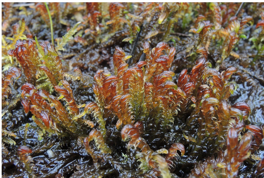
Figure 3. Hamatocaulis lapponicus in Viiankiaapa, Sodankylä.