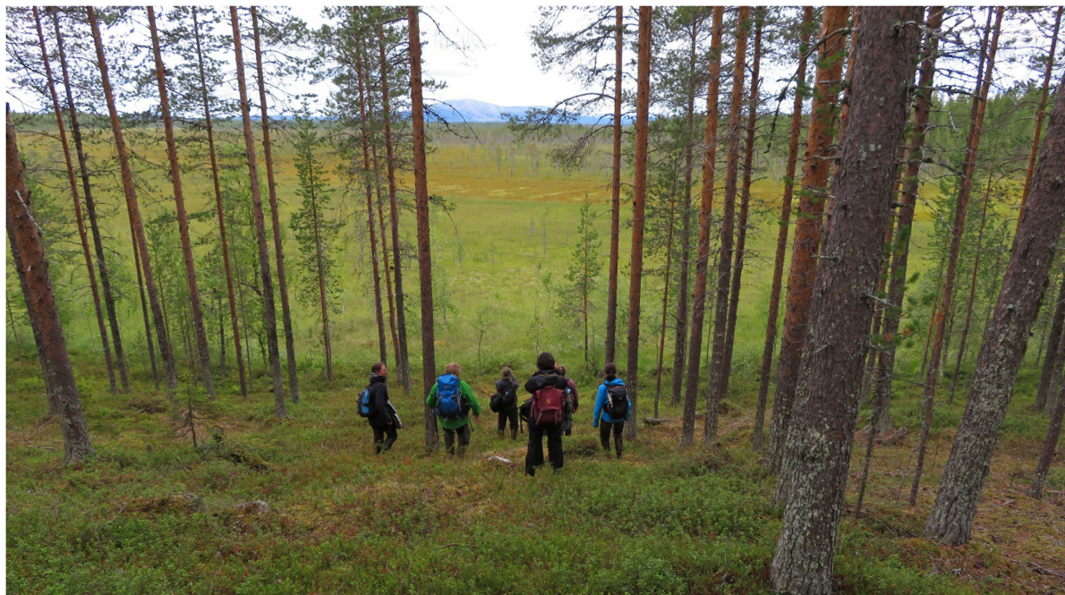
Figure 4. Tuulijoki mires, Kittilä.

Tuulijoki is a mostly oligo-mesotrophic mire area that is in the process of being established as a nature conservation area (Fig. 4). A northwest-southeast ridge runs across the mire, and locals use it as a recreational area. We started from the southern part of the mire (Lehmäkaltionvuoma mire; lehmä = cow, kaltio = spring, vuoma = mire), which was mostly oligotrophic with several abundantly flowing mesotrophic springs. For people of the south, the combination of Sphagna there seemed unusual, for instance, Sphagnum majus var. norvegicum , S. annulatum , S. balticum , S. angustifolium and S. fuscum were growing intermixed.