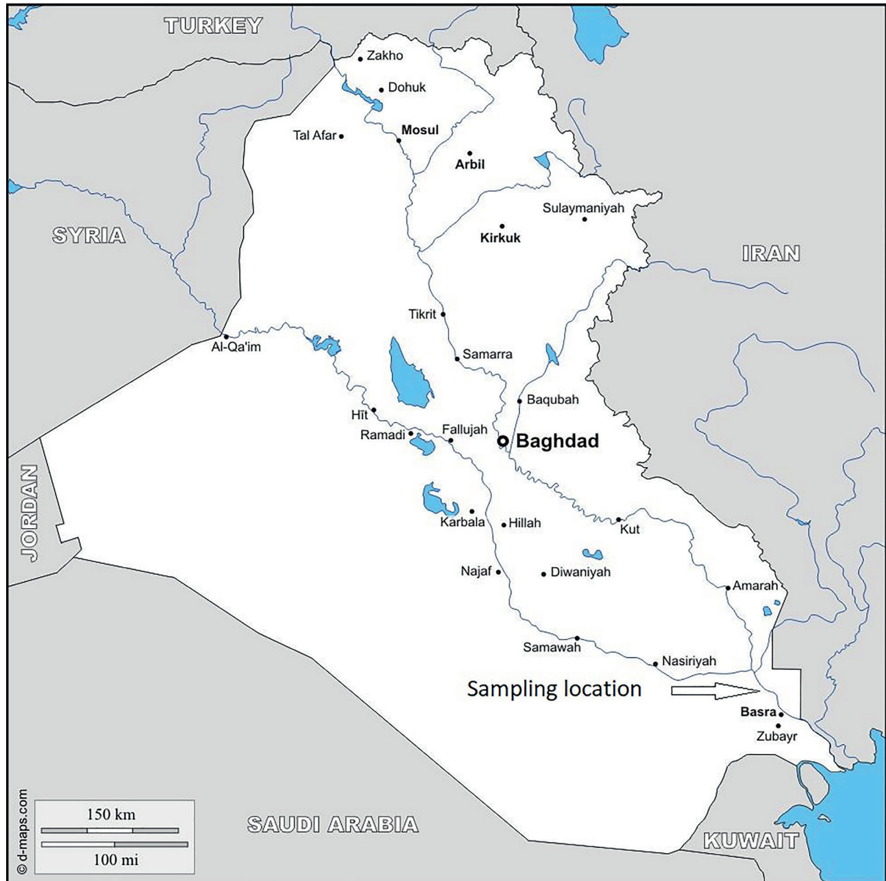
Fig. 1. Map showing the locality of collection (arrow) of Pterygoplichthys pardalis (Castelnaud, 1855) in the Shatt al-Arab River, Basrah, southern Iraq.

The present study reports on the presence of the Amazon sailfin catfish in the Shatt al-Arab River at Basrah, Iraq, where 175 individuals of P. pardalis were collected in 2017. This is the first record of this species from the freshwater system of Iraq in general and from the Shatt al-Arab River in particular.