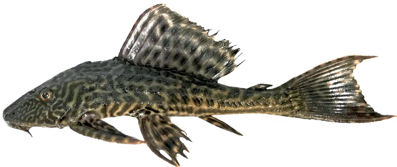
Fig. 2. Male of Pterygoplichthys pardalis (Castelnaud, 1855) from the Shatt al-Arab River, Basrah, Iraq; 132.6 mm TL.

SAMAT et al. (2016) found that the Amazon sailfin catfish reaches maturity at 125 mm and 130 mm SL for males and females, respectively. With a size range of 125.7 to