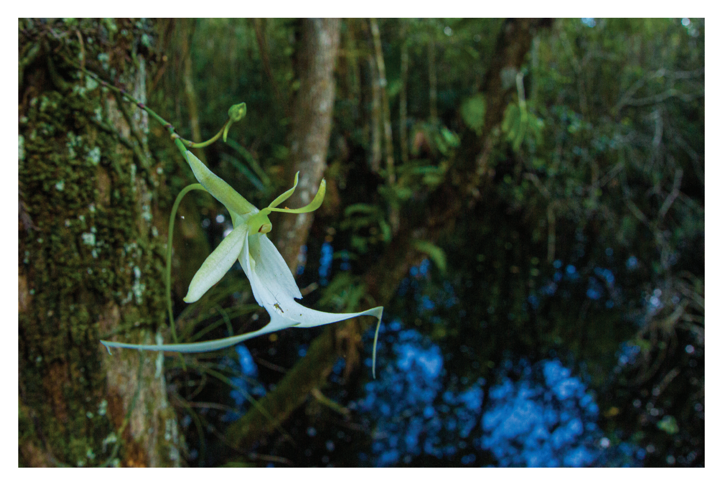
Fig. 1. A ghost orchid, Dendrophylax lindenii, flower and bud in the flooded forests of Fakahatchee State Park, Florida. One of 2 individuals observed having an association with Crematogaster ashmeadi. A mosquito is seen resting on the labellum of the flower.

Observations were conducted in the Fakahatchee Strand Preserve State Park in Collier County, Florida. The lowest part of the Everglades and Big Cypress basins in elevation, Fakahatchee is a unique subtropical strand forest, characterized by slow-flow, seasonally flooded sloughs that are dominated by pop ash ( Fraxinus caroliniana Mill.; Oleaceae) and pond apple ( Annona glabra L.; Annonaceae) the primary hosts in Florida for the epiphytic D. lindenii (Fig. 1). The presence of royal palms and bald cypress adds to the distinctiveness of these forests, as this sympatry is not found anywhere else in the world. Fakahatchee contains the highest diversity of orchids (> 49 spp.) and bromeliads in the USA.