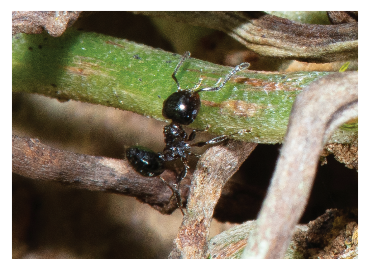
Fig. 3. An individual Crematogaster ashmeadi patrolling the roots of Dendrophylax lindenii .

2020 — Florida Entomologist — Volume 103, No. 3