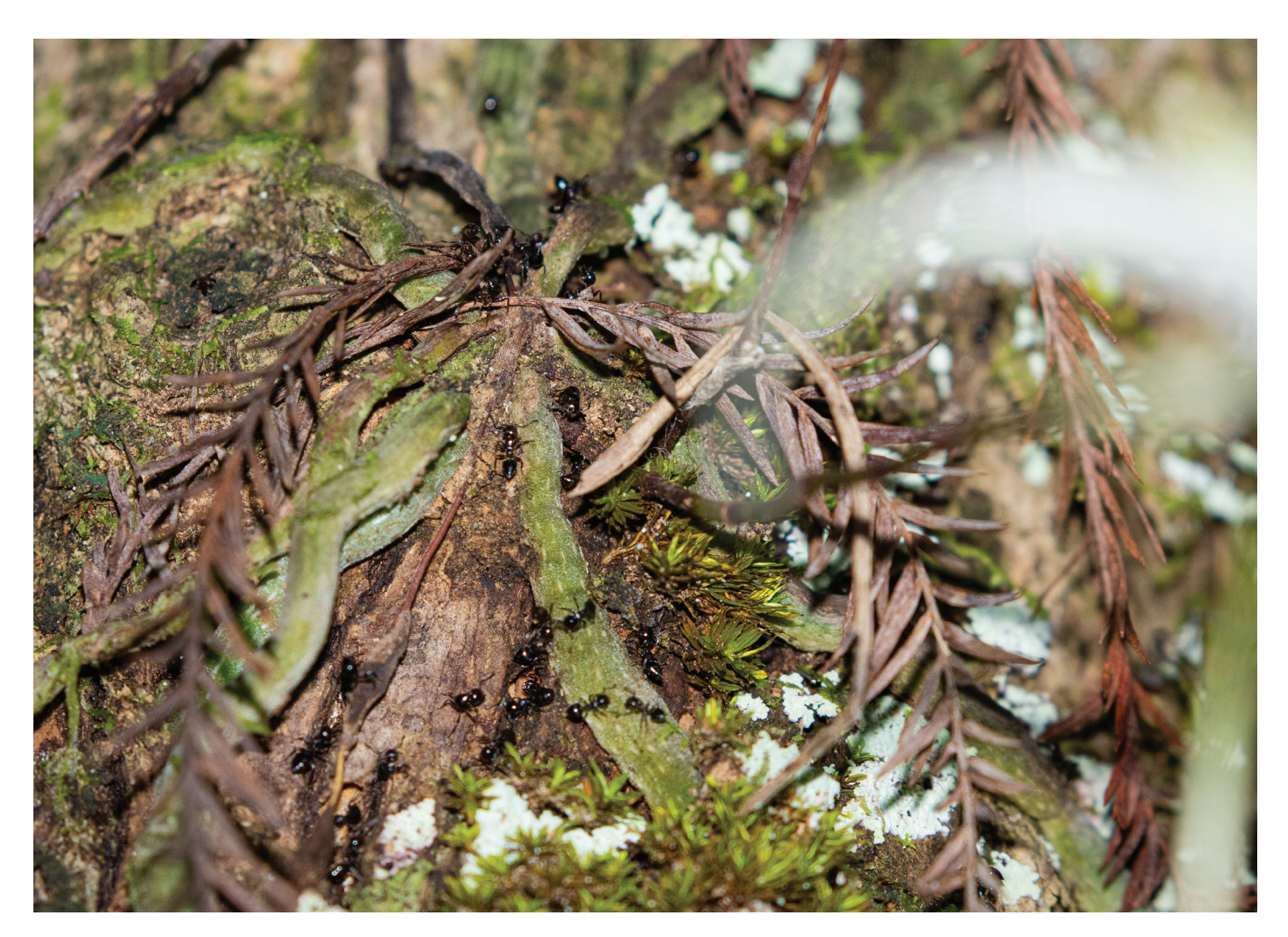
Fig. 2. Crematogaster ashmeadi emerge and return via cavities excavated beneath roots of Dendrophylax lindenii. Individuals make mandible contact with the roots.

Photos, videos, and direct field observations indicated that the ants were patrolling the orchid (Figs. 2, 3). Individuals moved in and out of