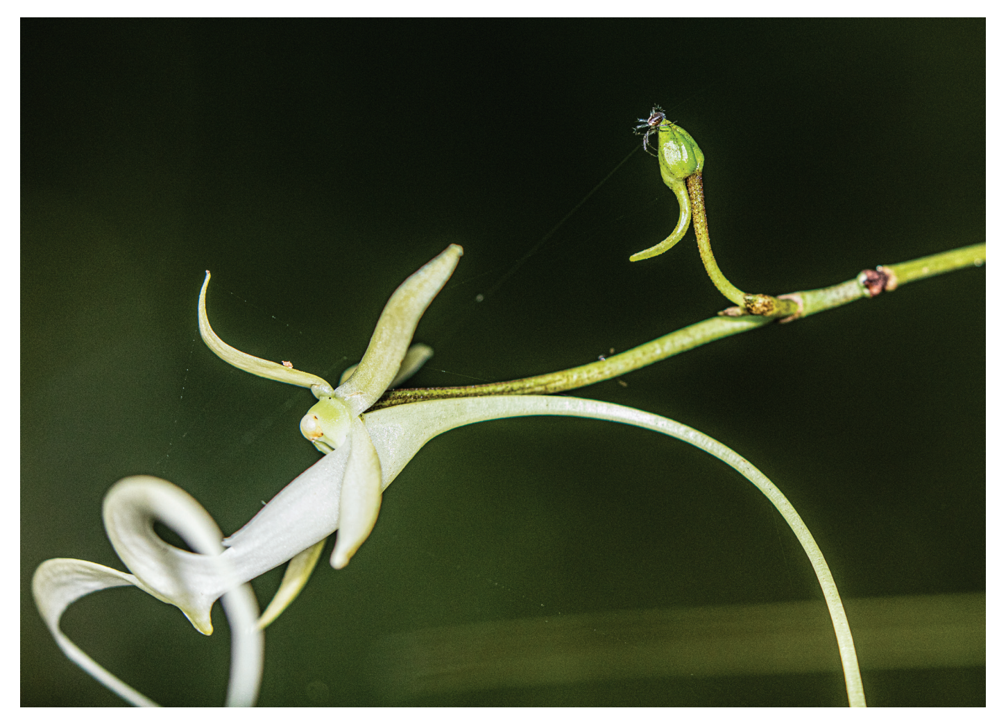
Fig. 4. A spider of the Family Araneidae descends and begins constructing a web on a ghost orchid flower. The flowers are frequented by mosquitoes, which may be the target prey.

In our study, C. ashmeadi was observed only on developing inflorescences of D. lindenii with buds (Figs. 2, 3, 6), suggesting the possibility of extra floral nectaries on those structures and spikes, or a possible role of volatile compounds. Extrafloral nectaries contribute to the greatest number of ant-orchid associations (Fisher 1992) that can occur on nearly all orchid structures, and secrete nectar from glands on developing inflorescences, shoots, buds, and fruits (Marazzi et al. 2013). Furthermore, biotic and abiotic factors influence extra floral nectary production in the wild, which can strongly affect ant-plant interactions