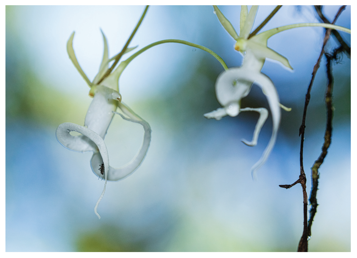
Fig. 5. A mosquito, Aedes taeniorhynchus, rests on a Dendrophylax lindenii flower. This is a common occurrence that may indicate insect attraction to volatile compounds emitted by the orchid, and also potential prey for ambush predators on its flowers.

in situ (Jones et al. 2017). In a floristic study of the Everglades of southern Florida (Koptur 1992), 9% of species (78 of 851 spp.) were reported to contain extra floral nectaries. Although D. lindenii was not one of the 9 orchid species identified with extra floral nectaries, that study did not state if this orchid was assessed. However, we believe that this species was not present because the primary focus of investigations were carried out in Everglades pineland and sawgrass prairie habitats rather than flooded forests characteristic of D. lindenii in the Big Cypress Basin. Indeed, Hoang et al. (2016) dissected numerous D. lindenii for anatomical studies that were germinated from southern Florida seeds and did not identify extrafloral nectaries on the stem, root, or leaf primordia (N. H. Hoang personal communication). The study of extra floral nectaries within flooded forest habitats remains limited (Koptur 1992). Based on observations of mandible prodding of roots by ants in our study (Fig. 3), root masses warrant further inspection for possible secretions. As stated earlier, it is possible also that volatiles, rather than extra floral nectaries, play a role in attracting ants to this orchid (Willmer et al. 2009).