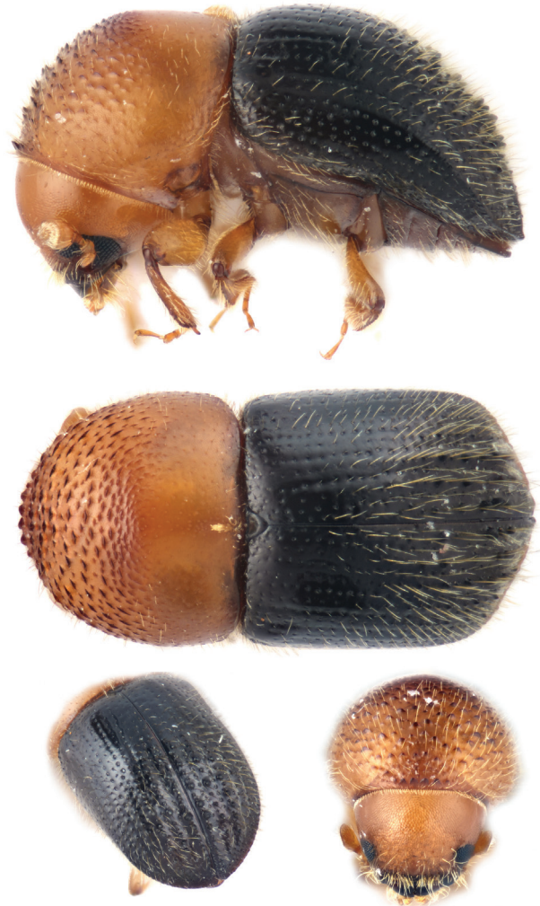
Fig. 2. Holotype of Xylosandrus aurinegro sp. nov. , female, from left to right: lateral view, dorsal view, posterior oblique view of declivity, anterior view of head. Specimen: 2.15 mm.

Head. Frons convex with surface reticulate, sparsely punctured; punctures between eyes with erect setae. Epistoma with dense row of short setae along lower margin. Eyes deeply emarginate, upper portion smaller. Antennal funicle 5-segmented (including pedicel), scape (short and stout) and funicle with scattered hair-like setae of variable size; club obliquely truncate, first segment sclerotized, forming a circular