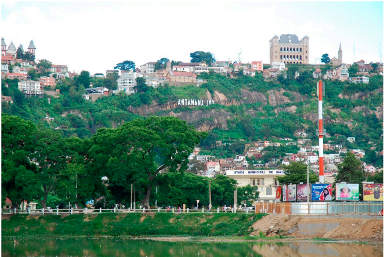
Fig. 2. – Inselberg in the capital Antananarivo with the “Palais de la Reine”.

rich in locally endemic species and possess more habitat specialists than similar habitats in most other tropical regions.