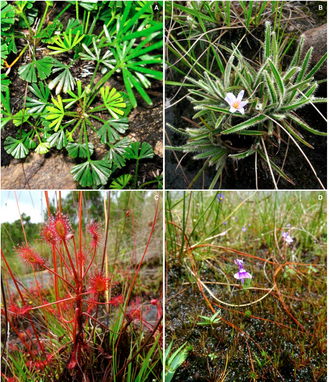
Fig. 5. – A. Actiniopteris dimorpha Pic. Serm. ( Pteridaceae ) a desiccation-tolerant species of fern at Vohidava, Ihoisy; B. Xerophyta sp. ( Velloziaceae ) near Anjoman'Akona, south of Ambositra; C. Drosera madagascariensis DC. ( Droseraceae ); D. Utricularia sp. ( Lentibulariaceae ). [A: Razafindraibe et al. 300; B: Rakotoarivelo et al. 287; C: Rabarimanarivo et al. 745; D: Rabarimanarivo et al. 705]