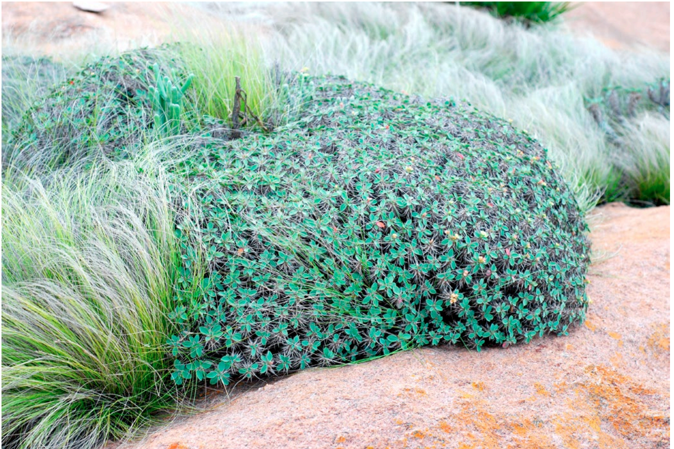
Fig. 4. – Euphorbia horombensis Ursch & Leandri ( Euphorbiaceae ) a succulent on open rocks at Vohitsanavo inselberg, Anja Park (Fig. 3: n° 23). [Razafindraibe et al. 278]

(B.S. Williams) Schltr., Angraecum pseudofilicornu , Oeceoclades calcarata (Schltr.) Garay & P. Taylor, Sobennikoffia humbertiana ) were present.