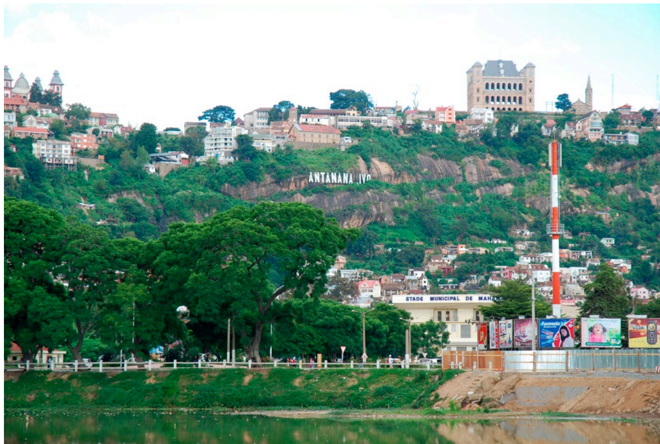
Fig. 2. – Inselberg in the capital Antananarivo with the “Palais de la Reine”.

rich in locally endemic species and possess more habitat specialists than similar habitats in most other tropical regions.