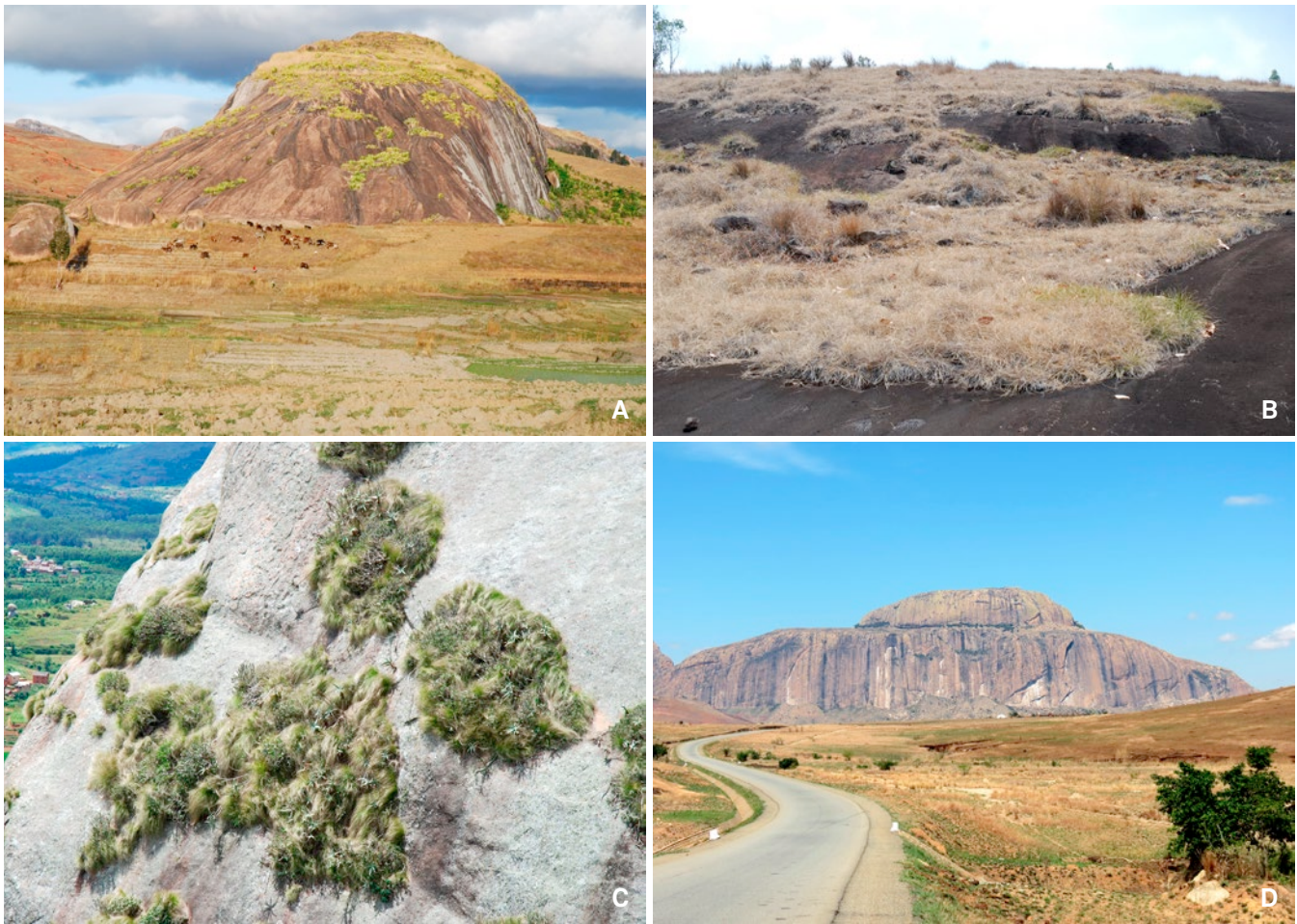
Fig. 6. – A. Inselberg, south of Anja Park (Tangorika) covered with Furcraea foetida (L.) Haw. (Asparagaceae); B. Mat with Styppeiochloa hitchcockii (A. Camus) Cope (Poaceae) near Angavokely; C. Mats formed by Coleochloa setifera (Ridl.) Gilly (Cyperaceae) and steep slopes, south of Fianarantsoa; D. General overview of "Bonnet du Pape, at Voatavo (Fig. 3: n° 26).

exceptions include those within certain National Parks such as Andringitra and Marojejy. In unprotected areas globally, inselbergs often support the last remnants of natural vegetation in a given area. While certain types of human use of inselbergs have occurred for generations and do not seem to have caused severe damage, in recent times human impact appears has become by far more destructive resulting in steadily growing pressure on these areas, and today most inselbergs in Madagascar exhibit detrimental human impacts. These include: the over-collection of certain useful species which impacts local populations or even threatens local endemics with extinction; use of inselbergs for grazing cattle and goats; uncontrolled bush-fires, usually resulting from the widespread burning of grasslands for agriculture, that may significantly impact the population of individual species and which are also responsible for habitat degradation or destruction as a whole (see WHITMAN et al., 2011 for a study of the influence of fire and water availability