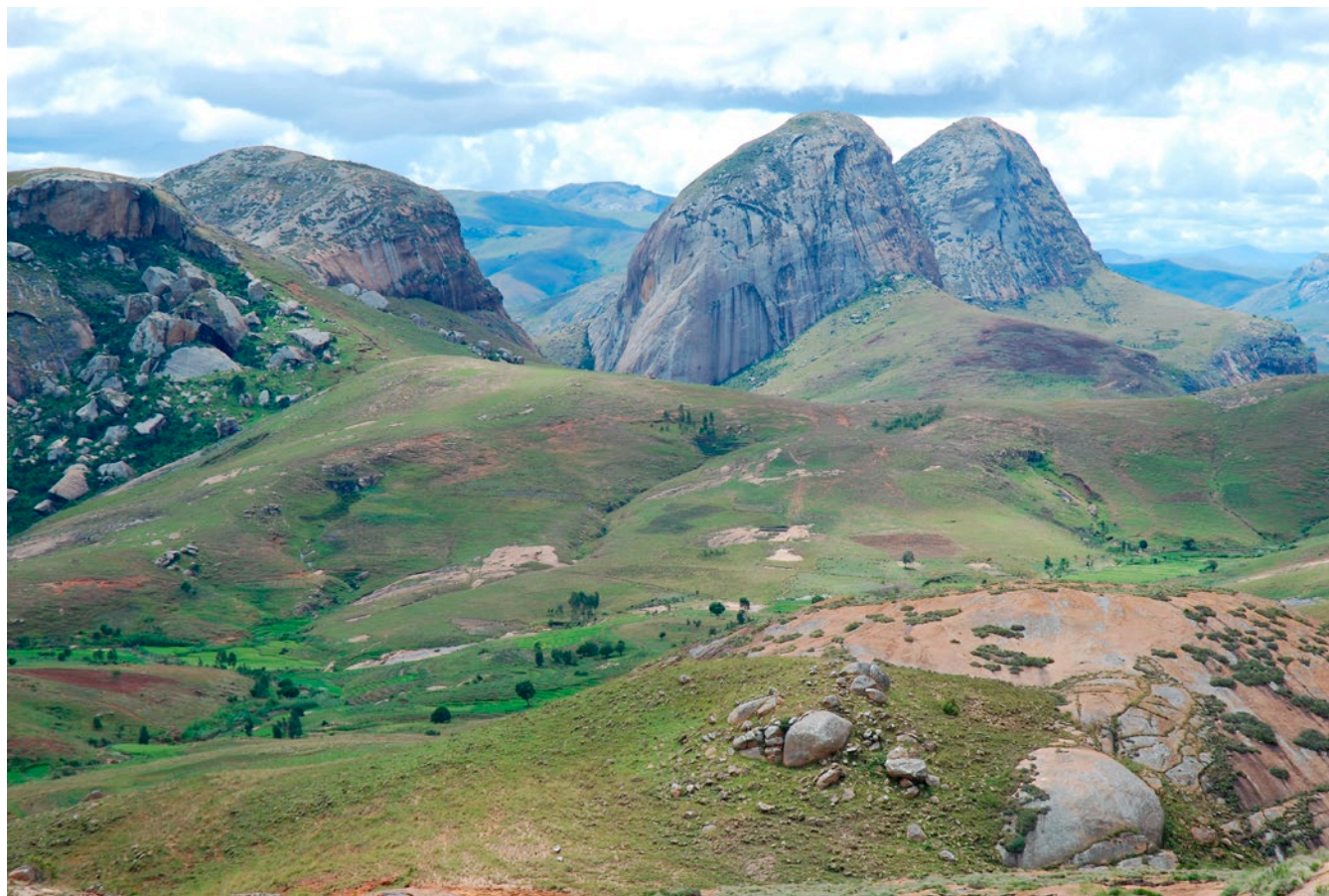
Fig. 1. – Inselberg landscape, near Ambalavao.