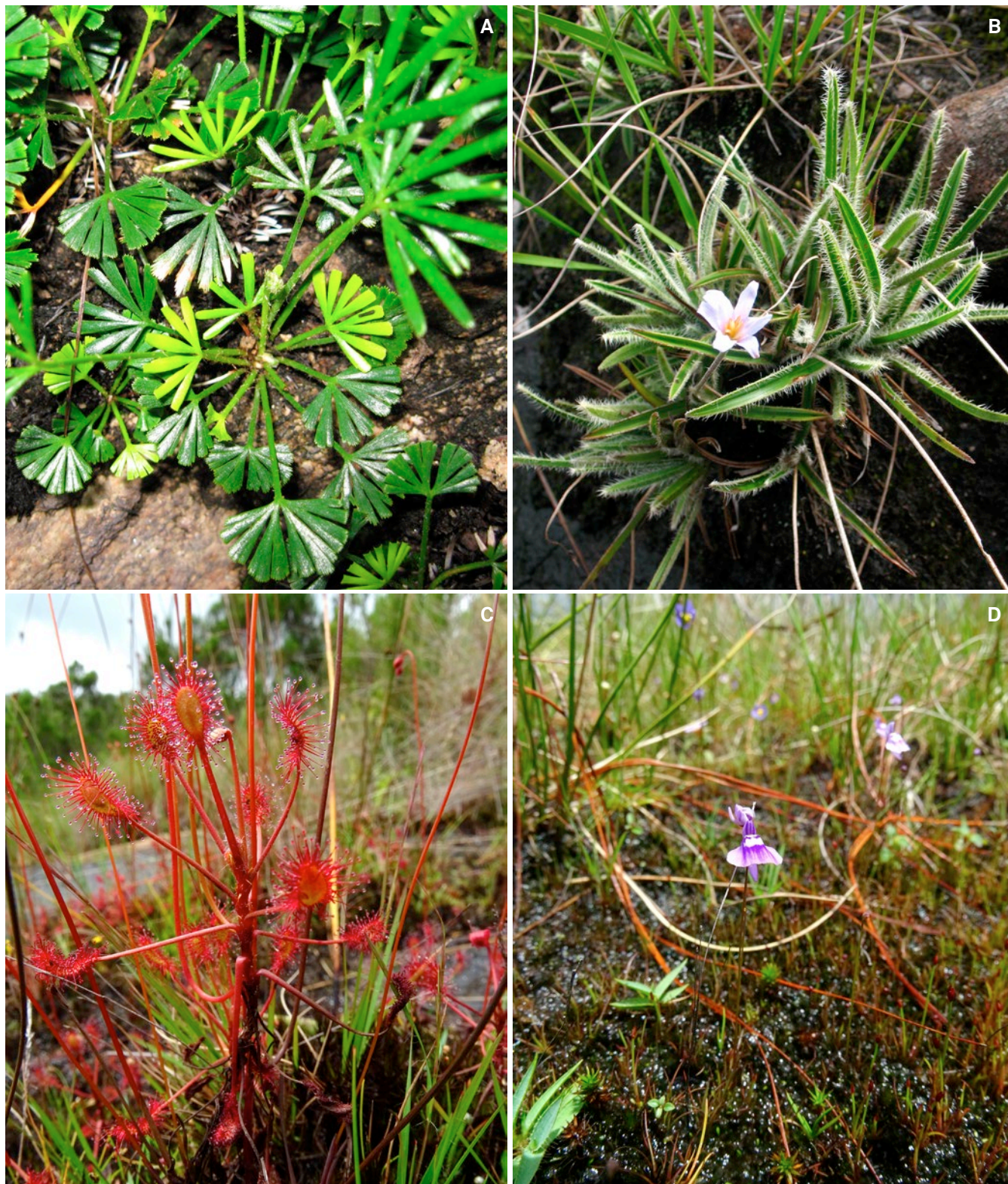
Fig. 5. – A. Actiniopteris dimorpha Pic. Serm. ( Pteridaceae ) a desiccation-tolerant species of fern at Vohidava, Ihosy; B. Xerophyta sp. ( Velloziaceae ) near Anjoman'Akona, south of Ambositra; C. Drosera madagascariensis DC. ( Droseraceae ); D. Utricularia sp. ( Lentibulariaceae ). [A: Razafindraibe et al. 300; B: Rakotoarivelo et al. 287; C: Rabarimanarivo et al. 745; D: Rabarimanarivo et al. 705]