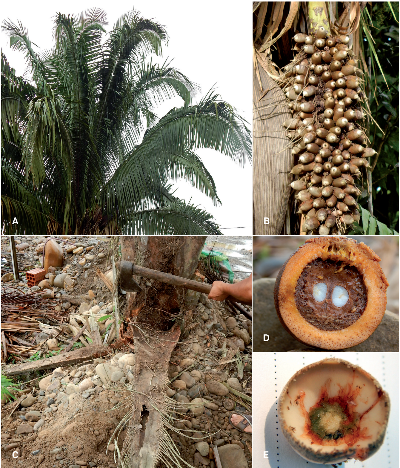
Fig. 2. – Attalea blepharopus Mart. A. Growth habit; B. Inflorescence at ripe stage; C. Fibrous margins of leaf base; D. Cross section of fruit showing two developing seeds; E. Staminodial ring adnate to corolla (removed from a fruit) appears densely ciliate in the margins.