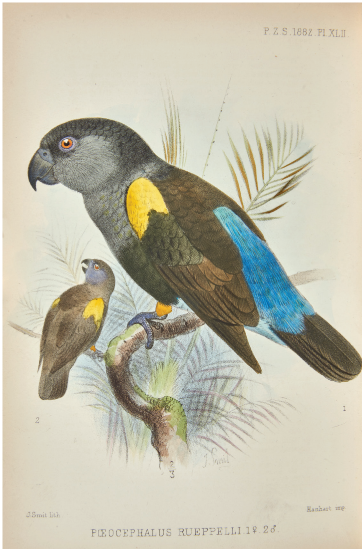
Figure 10. Pl. XLII in Sclater (1882): the bird illustrated was one of two females received by London Zoo in April 1882 from northern Angola, and has the blue rump characteristic of female Rüppell's Parrot Poicephalus rueppellii but which is paler in colour than that of Namibian parrots, a fact Sclater failed to notice

by Andersson in Namibia that he had examined years earlier. The blue in the latter was much darker than that of the birds that died in the Society's Menagerie (= London Zoo) and were collected in 'West Africa' (= Angola, see Figs. 3 and 9). These were of the same morphotype as Gray's (1849) holotype of rueppellii but the differences from the commoner and more widespread Namibian population went unnoticed for 137 years.