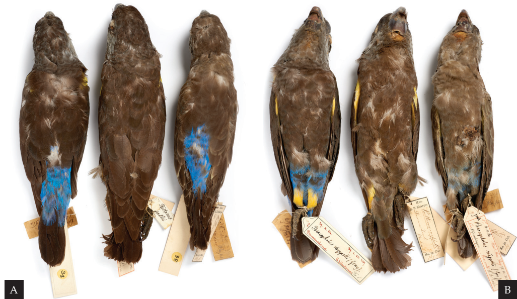
Figure 6. Type material of Poicephalus rueppellii mariettae, from left to right (in both A and B): holotype, adult female, NHMUK 1889.1.20.647; paratypes, adult male, NHMUK 1878.12.31.502, and juvenile, NHMUK 1878.12.31.431, all from Otjimbingwe, Damaraland, Namibia