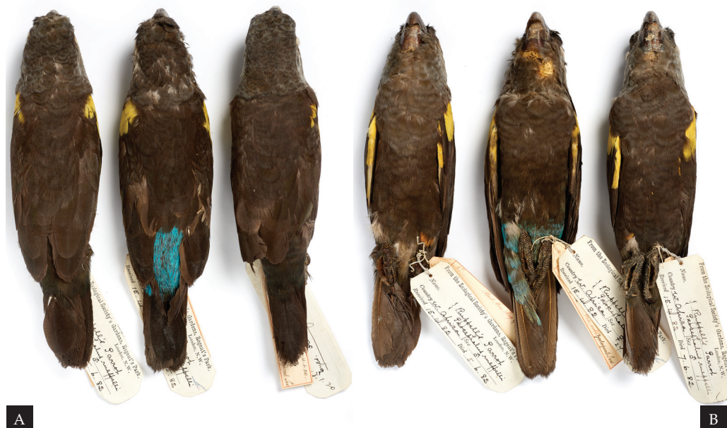
Figure 9. Three of the four specimens received alive at London Zoo in April 1882 and which died in June 1882, from left to right: male, NHMUK 1890.4.1.19; male, NHMUK 1890.4.1.20; female, NHMUK 1890.4.1.21