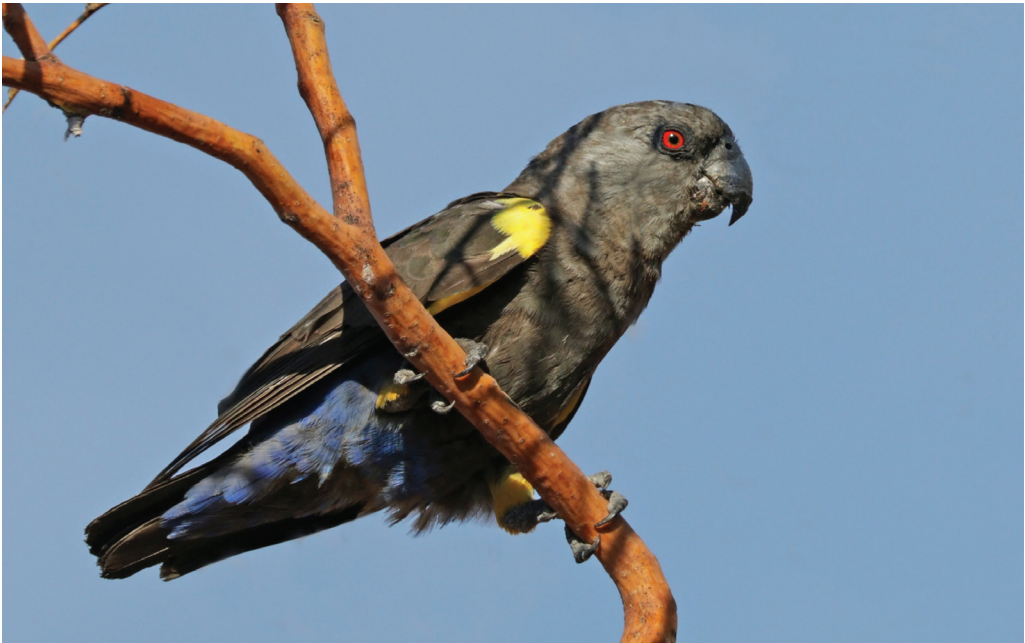
Figure 4. Female of the recently described Poicephalus rueppellii mariettae , Namibia, 4 March 2018; this taxon, with dark ultramarine-blue plumage in females, is better known and more widespread than the nominate subspecies