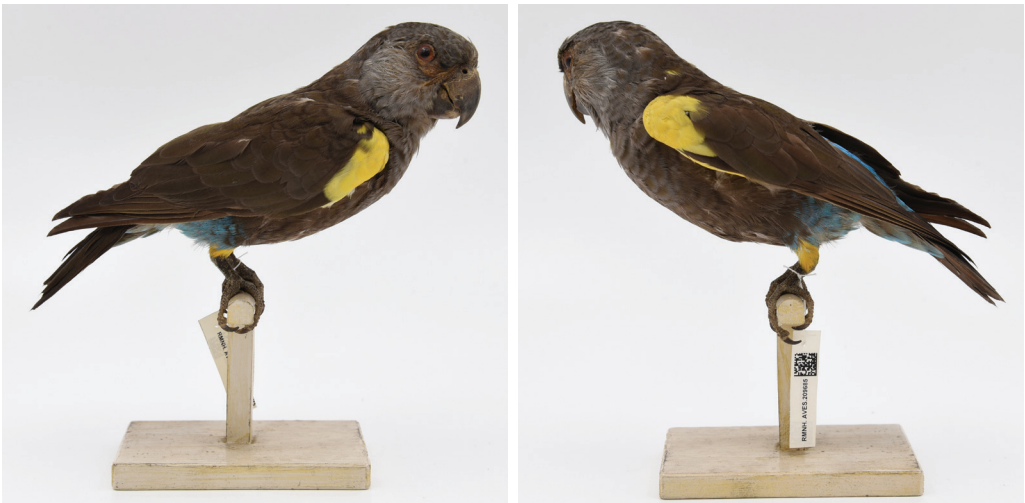
Figure 5. Specimen of nominate Rüppell's Parrot Poicephalus rueppellii from north Angola, in the Naturalis Biodiversity Center, RMNH.AVES.209654, which is smaller and overall darker but has the blue rump and belly paler than birds from south-west Angola and Namibia

description, does not mention 'river Nunez' as its provenance. Consequently, the epithet rueppellii must be assigned to the smaller, darker northern taxon, which as far as is known occurs only around the towns of Benguela and Luanda in Angola. As a result, we propose to restrict the type locality to 'Luanda', after the shared locality of the only two specimens at NHMUK with precise data in this respect (NHMUK 1911.12.18.146, St. Paul de Loanda,