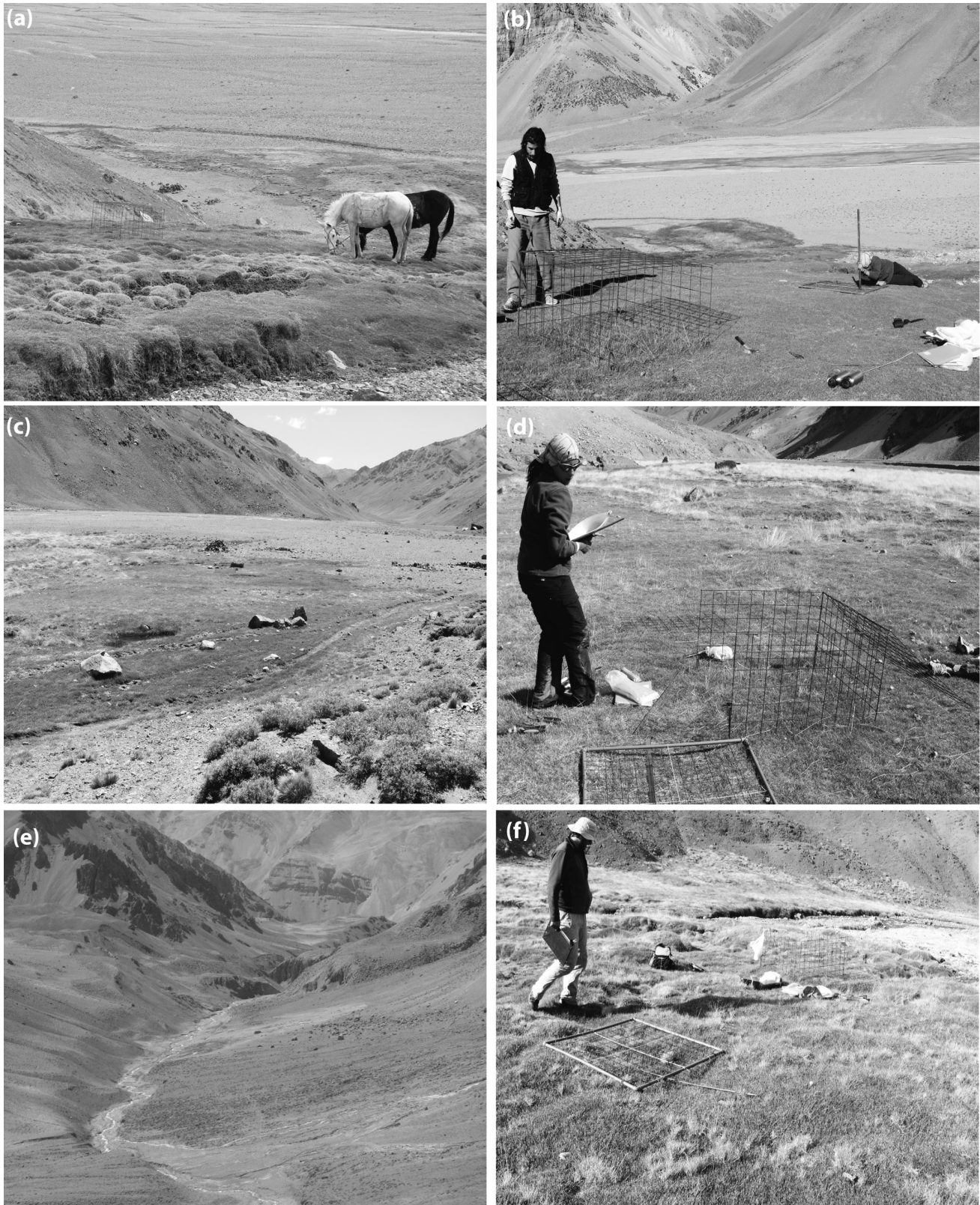
FIGURE 2. General view of the three meadows (left) and of an enclosure in each alpine meadow at the end of the experiment in March 2011 (right) in Aconcagua Provincial Park. (a, b) Meadow 1, (c, d) Meadow 2, and (e, f) Meadow 3.

species. Multiple hits per point were possible where different species occurred at the same point. The number of points that touched litter underneath living vegetation was also recorded. These data were