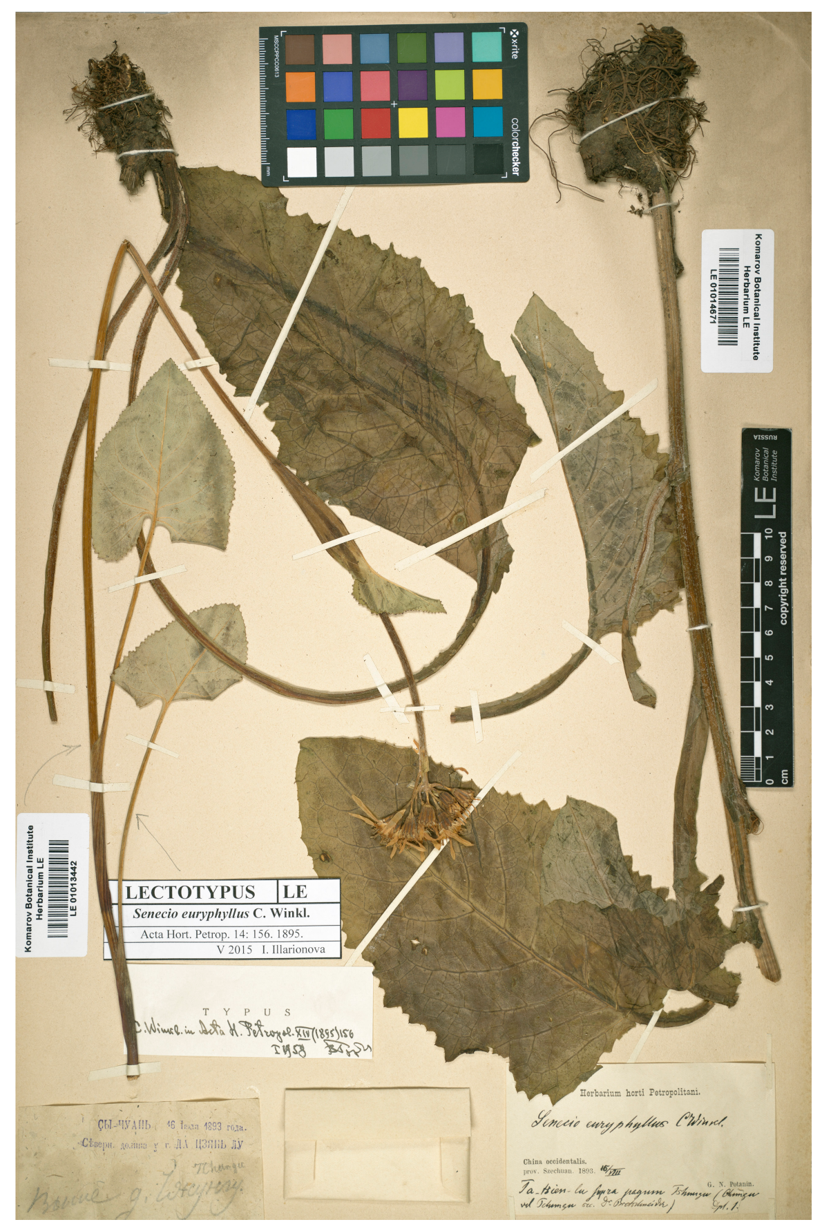
Fig. 1. Lectotype of Senecio euryphyllus C. Winkl. – LE01013442, the left-hand stem with the inflorescence.