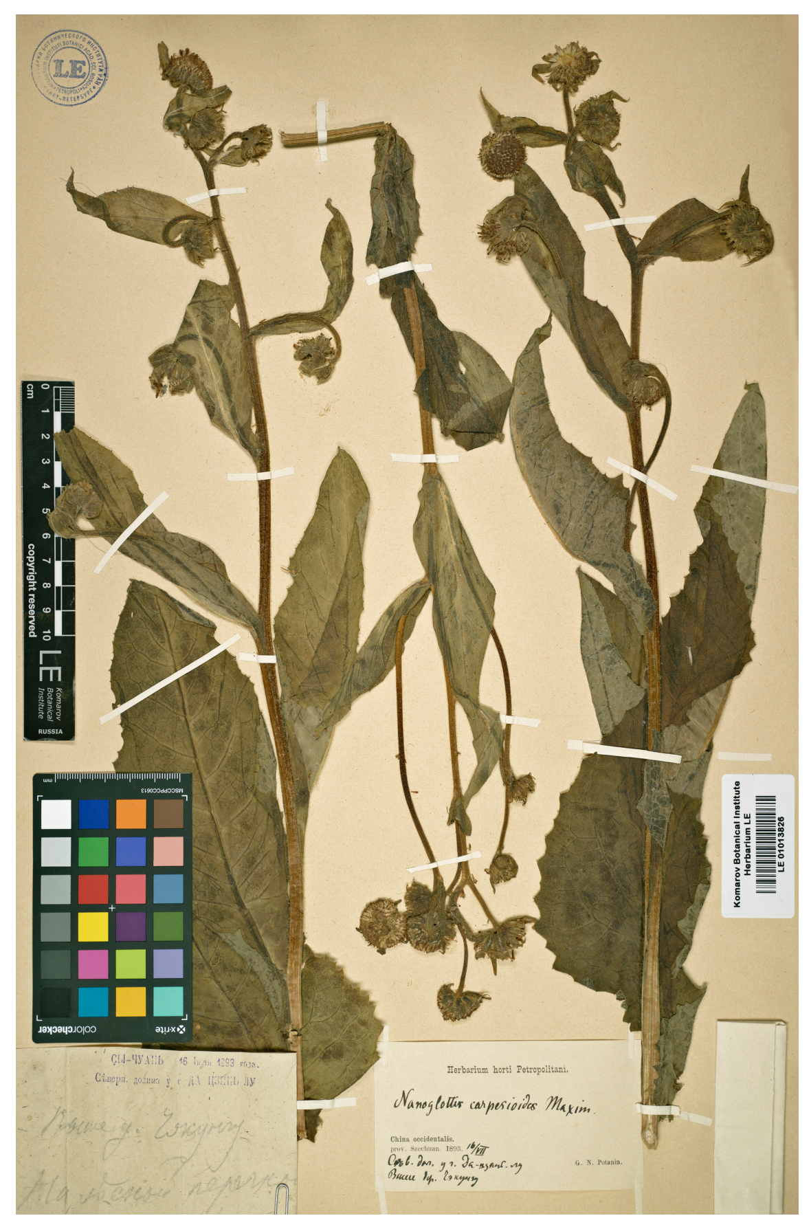
Fig. 3. Specimen of Nannoglottis carpesioides Maxim. – LE01013826. – Reproduced with permission, © Komarov Botanical Institute of the Russian Academy of Sciences.