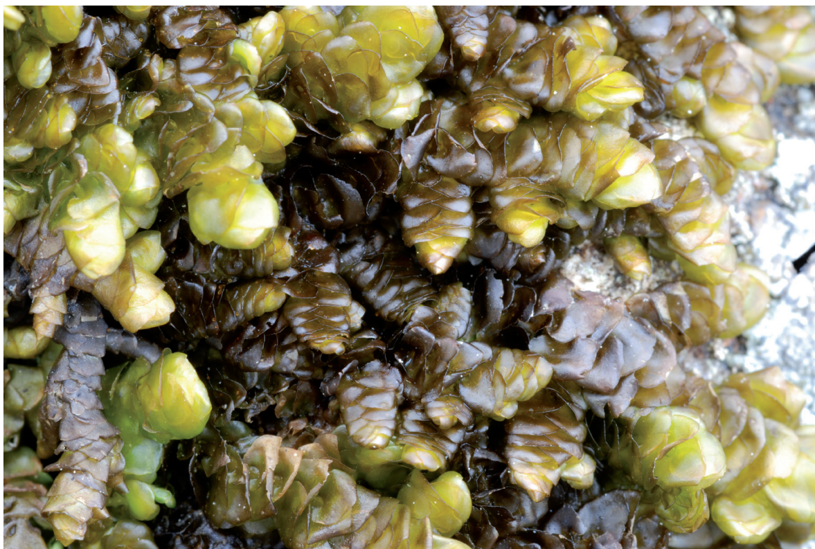
Figure 1. Porella obtusata growing in yellowish green glossy patches with a characteristic secondary brownish pigmentation.

Collections of Porella obtusata in Norwegian herbaria were examined by the first author. Both old and new collections and field notes are available at “Artskart” (Artsdatabanken and GBIF 2015). During recent years, the species has been systematically searched for in areas where it could be expected to grow. This field work has been conducted in important areas for nature management and partly on contract for the management authorities. In particular we have searched for P. obtusata in areas with calcareous or other base-rich bedrocks close to the sea in the oceanic southwestern districts of the counties Rogaland and Hordaland. Geographic coordinates of all registered populations were taken with handheld GPS with an accuracy of \pm 10 m. Notes on habitat, substrate and altitude were made at each locality. Associated species were registered at some localities. Collections from new localities are deposited in public herbaria, mainly TRH.