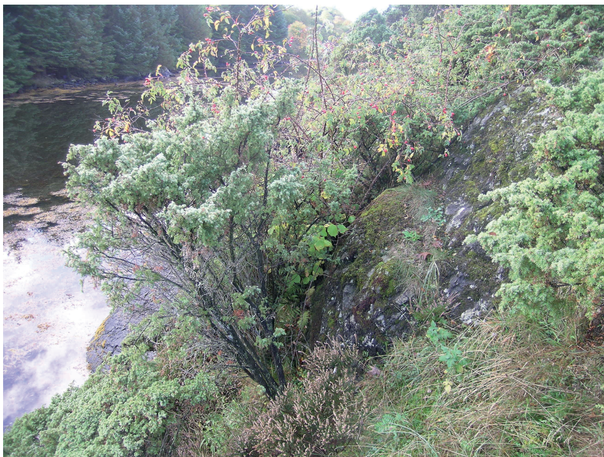
Figure 5. Shrub encroachment, due to reduced grazing by livestock, is a general threat that applies to most localities of P. obtusata , like here at Bømlo, Hordaland. (Photo J. B. Jordal).

least eight localities are threatened by habitat loss due to construction work (Fig. 4, Table 1).