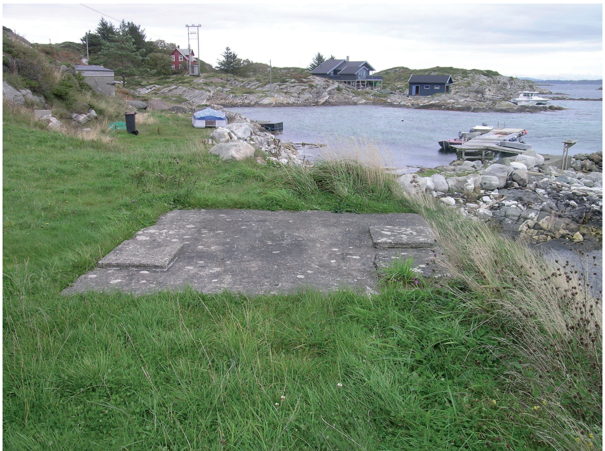
Figure 4. At least eight localities of P. obtusata are threatened by habitat loss due to construction work, like here at Litla Kalsøy in Austevoll, Hordaland. (Photo J. B. Jordal).

Two of the 34 localities were destroyed due to fertilization by use of wet manure, and building of houses. At