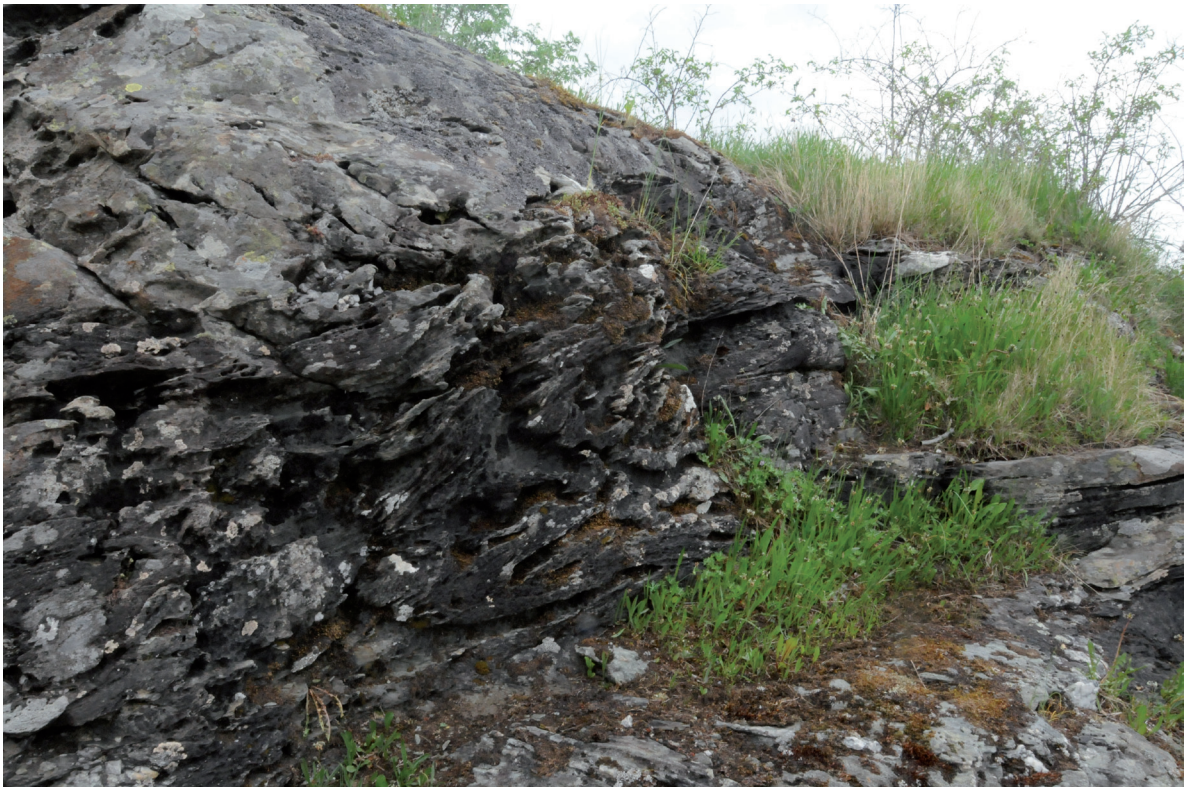
Figure 3. Porella obtusata is typically growing in small patches on sunlit base rich rocks close to the sea, like here at Bømlo, Hordaland.

Porella obtusata is usually found growing in thick patches or small carpets on sunlit calcareous rocks or other base-rich rocks close to the sea (Fig. 3). The substrates of P. obtusata along the Norwegian coast are different base-rich bedrocks like greenstone, marble and limestone. In Bømlo the species seems to have preference for greenstone and is not very frequent in the areas with limestone and marble. The Kvitsøy area is also rich in greenstone. The tendency of the rock to create fissures and small cavities may be of higher significance to the species than the kind of rock itself. Exposure varies between east/southeast and northwest, but most localities are southerly to westerly exposed. All new sites are below 20 m a.s.l., and most records are below 6–7 m a.s.l. At Alden island in Askvoll, Jørgensen (1934) cites B. Kaalaas 1889 on P. obtusata growing “up to 300 m”. This is very different from all other known Norwegian localities and should be confirmed. In Kvitsøy and Bømlo P. obtusata often grows in small fissures with trickling water, or protected against the wind and sun in small cavities made by erosion of the rocks. Sometimes it is found