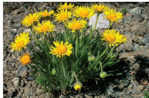
FIG. 5. Erigeron chrysopsidis (sect. Disparipili ). Heads are nodding in bud. Yellow-rayed species have evolved among white- and blue-rayed ones in sects. Disparipili , Erigeron , and Osteocaulis .

Erigeron salmonensis was recently described (Brunsfield and Nesom, 1989); the two species of sect. Arenarioides were regarded as closely related but isolated within the genus. Molecular data (Noyes, 2000a) indicate that E. tweedyi Canby (sect. Spathifolium ) is closely related to E. arenarioides – with this molecular pointer, morphological similarities between sect. Spathifolium and sect. Arenarioides are apparent, but sect. Spathifolium , as represented by E. tener , is placed by the molecular data most closely related to sect. Osteocaulis .