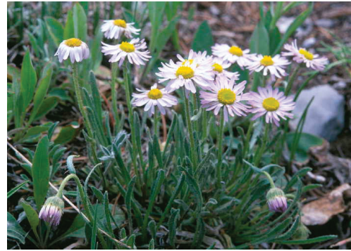
FIG. 4. Erigeron vetensis (sect. Stenactis). Ray corollas are reflexing, heads nodding in bud.

E. arenarioides (D.C. Eaton ex A. Gray) A. Gray ex Rydb.