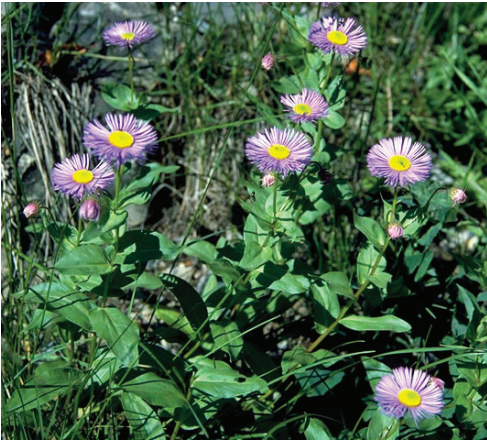
FIG. 2. Erigeron speciosus (sect. Fruticosus ).

1. Sect. Arenarioides (Rydb.) Nesom, Phytologia 67: 70. 1989. Erigeron [unranked sp. group] Arenarioides Rydb., Fl. Rocky Mts. 897. 1918, in clave. TYPE: Erigeron arenarioides (D.C. Eaton ex A. Gray) A. Gray ex Rydb.