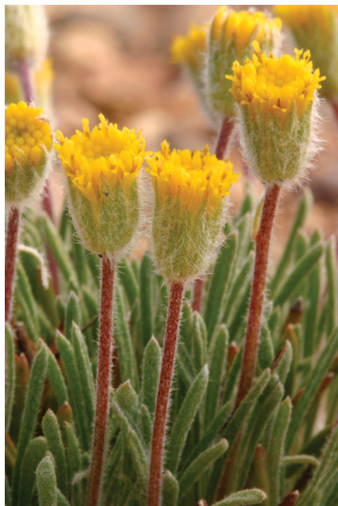
FIG. 6. Erigeron bloomeri (sect. Osteocaulis ). Ray florets are completely absent.

2. Sect Asterigeron Rydb., Fl. Rocky Mts. 891. 1918. TYPE: Erigeron watsonii Erigeron sect. Spathifolium Nesom, Phytologia 67: 84. 1989. TYPE: Erigeron tener (A. Gray) A. Gray