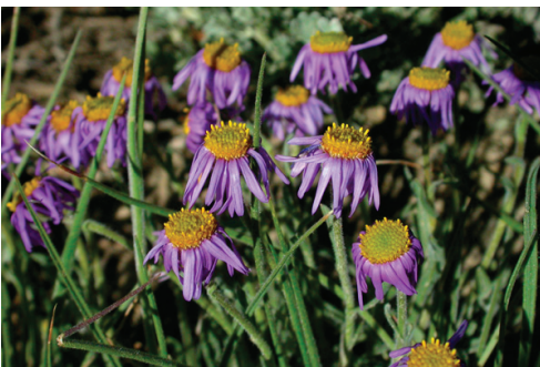
FIG. 3. Erigeron clokeyi (sect. Stenactis ). Ray corollas are reflexing, heads nodding in bud.

Taprooted, perennial; caudex branching, retaining old leaf bases; glabrous; stems branched; leaves filiform or linear to linear-oblongate, not clasping; heads erect in bud; rays white, often with an abaxial midstripe, not coiling or reflexing; achenes 1.5–2.2 mm long, 2-nerved; pappus of 10–16 bristles.