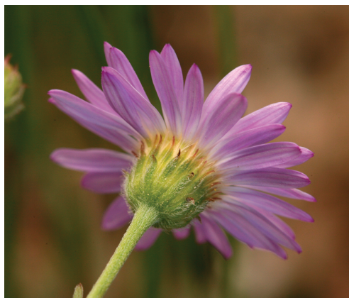
FIG. 7. Erigeron filifolius (sect. Filifolii ). Close-up of head.

Perennial, taprooted; caudex simple or more commonly a multicapital crown or with elongating branches, forming mats ( E. acomanus , E. tener ) connected by systems of lignescent rhizomes and caudex branches; vestiture short-strigillose to villous, hirsute, or glabrous, hairs white ( E. tener , E. acomanus , E. tweedyi , and E. wilkenii have similar vestiture; E. cronquistii , E. evermannii , E. subglaber glabrous to glabrate); stems branching (simple in E. acomanus , E. wilkenii ); leaves spatulate to oblanceolate, entire, with expanded and indurate petiole bases, often folding, not clasping; heads 1 or 1–3, nodding in bud ( E. acomanus , E. tweedyi ), behavior unknown in others; phyllaries with a broad green midband, minutely glandular; rays white to pink, not coiling (or coiling in