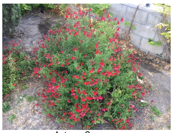
Autumn Sage Salvia greggii 'Red' SW Texas, Chihuahuan Desert