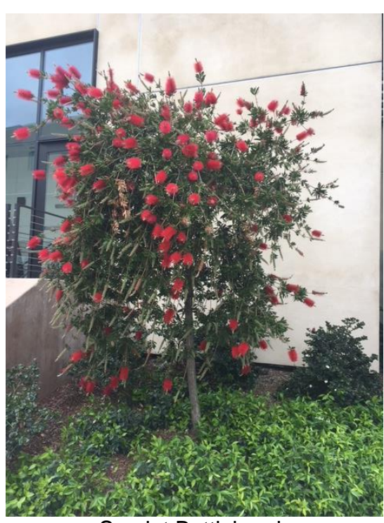
Scarlet Bottlebrush Callistemon citrinus Australia