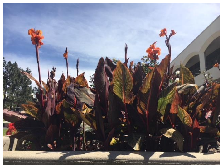
Canna lily Canna Tropics, temperate climates