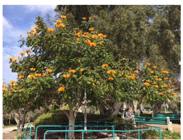
African Tulip Tree Spathodea campanulata Africa