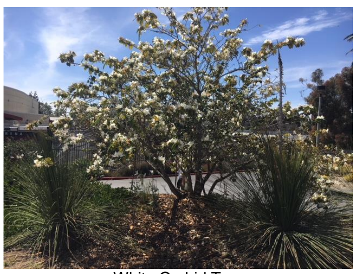
White Orchid Tree Bauhinia acuminata Malaysia, Indonesia *FRAGRANT*