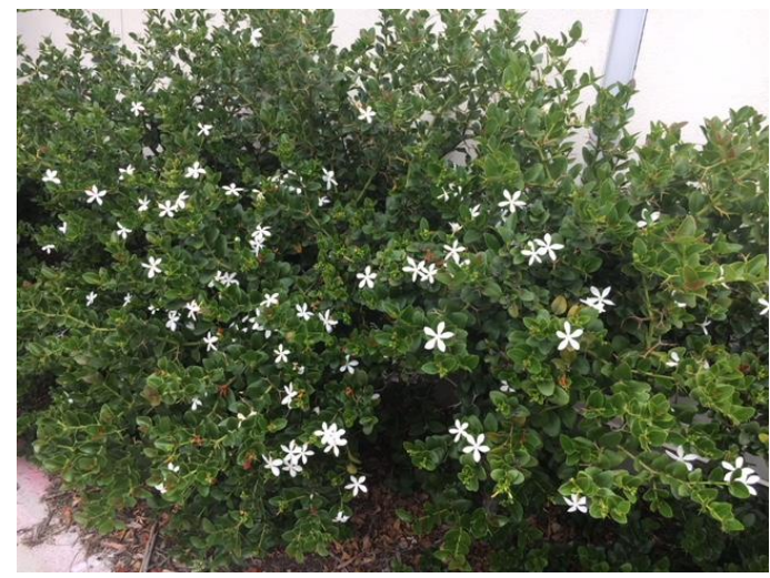
Natal Plum Carissa macrocarpa South Africa