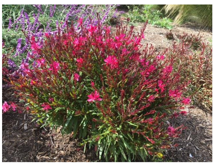
Pink Gaura Gaura lindheimeri 'Siskiyou Pink' Southern Louisiana and Texas