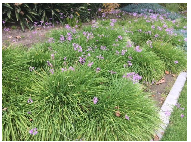
Society Garlic Tulbaghia violacea South Africa *FRAGRANT*- it stinks!