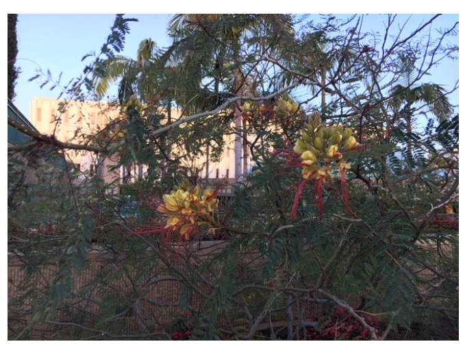
Mexican Bird of Paradise Erythrostemon mexicanus Texas, Mexico