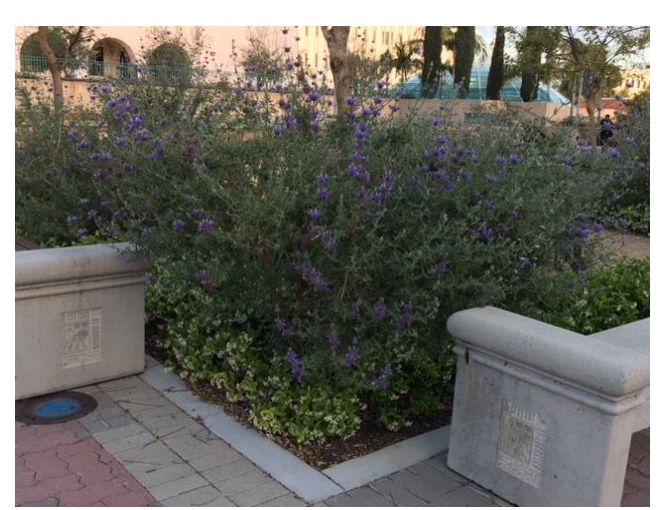
Cleveland Sage Salvia Clevelandii 'Allen Chickering' California Native *FRAGRANT*