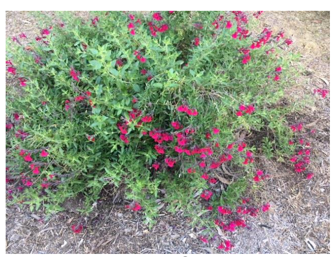
Autumn Sage Salvia greggii 'Raspberry' SW Texas, Chihuahuan Desert