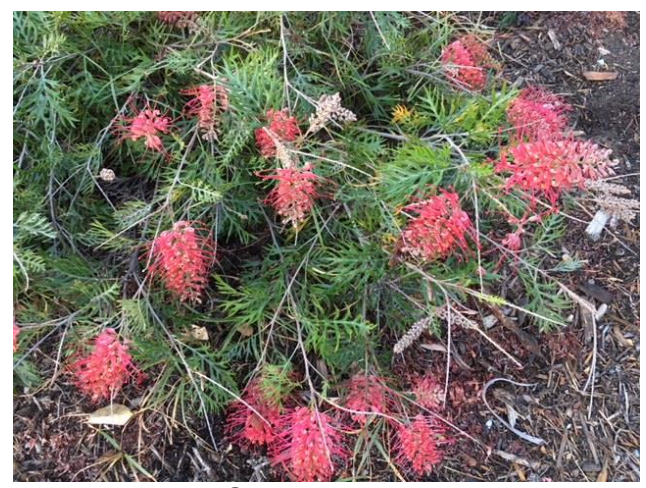
Spider Flower Grevillea Australia, New Guinea