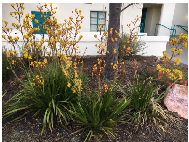
Bush Tenacity Kangaroo Paw Anigozanthos 'Bush Tenacity' Western Australia