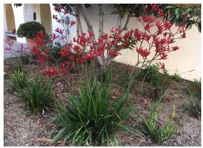
Kangaroo Paw Anigozanthos 'Big Red' Western Australia