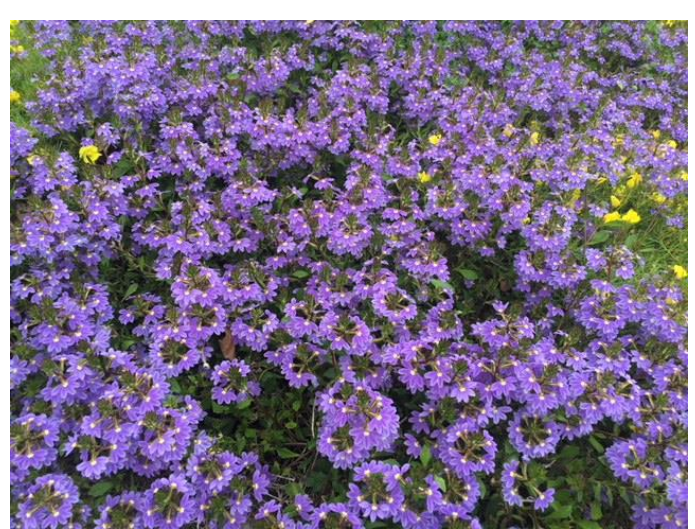
Fan Flower Scaevola Australia and Polynesia