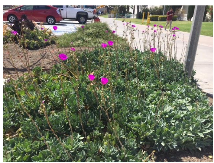
Rock Purslane Calandrinia spectabilis Australia, Chile, and Western North America