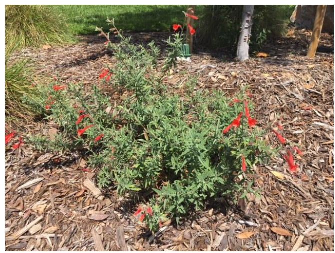
California Fuchsia Epilobium canum California Native