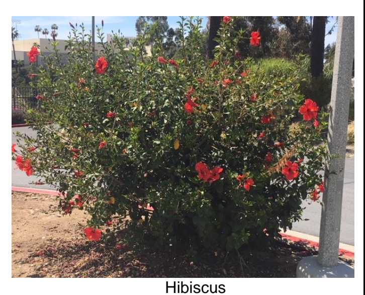
Hibiscus Hibiscus Subtropical and tropical regions