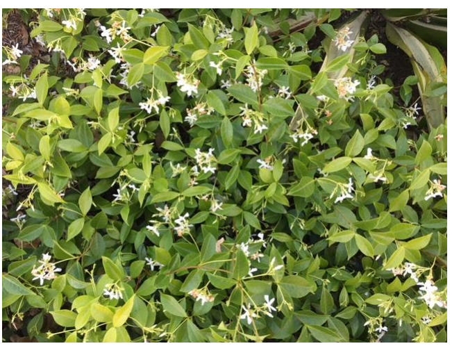
Star Jasmine Trachelosperumum jasminoides Southeastern Asia *FRAGRANT*