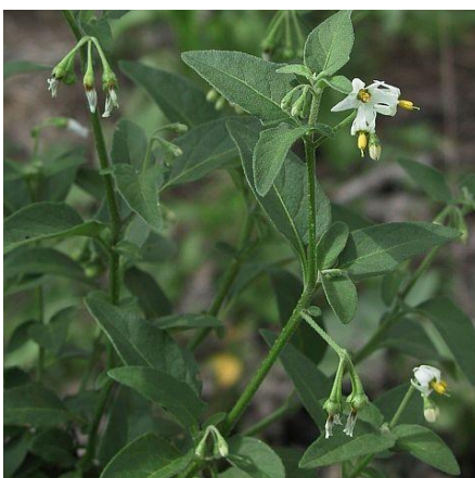
White-tip nightshade ( Solanum chenopodioides ) has black berries which are eaten by birds, so it tends to come up under trees. It is not common in the reserve and could be hand pulled in passing. Purpletop ( Verbena bonariensis ) can be up to 2m high, unlike the similar veined verbena (page 3). It becomes common after disturbance.