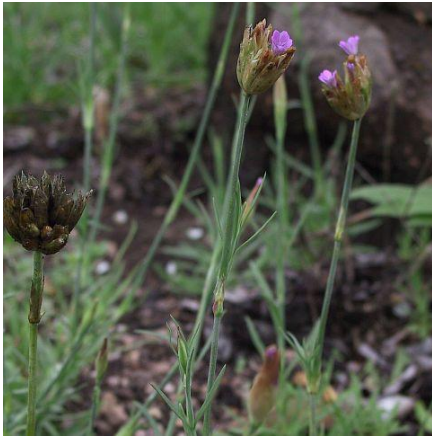
Proliferous pink ( Petrohragia nanteuillii ) has grey-green narrow leaves in pairs and clusters of tiny pink flowers. The seed capsules are at centre left above.

Following are three minor weeds, for which control is not necessary. They seldom become very abundant and are only annuals.