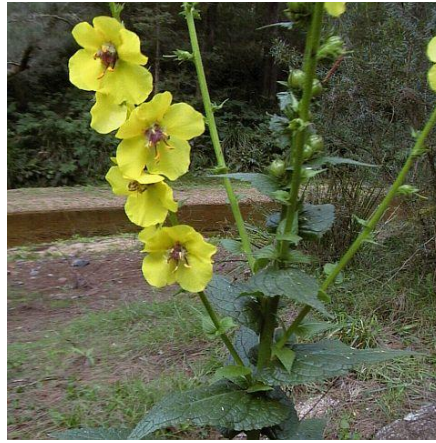
Twiggy mullein ( Verbascum virgatum ) has the same type of flowers and seed capsules as giant mullein.