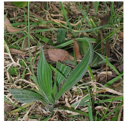
The leaves of ribbed plantain are held in a basal rosette, either flat and spreading or erect. There is a smaller native plantain (see page 8 of the natives guide) which can be distinguished by the small teeth along the leaf margins, and narrower, longer flower spikes.