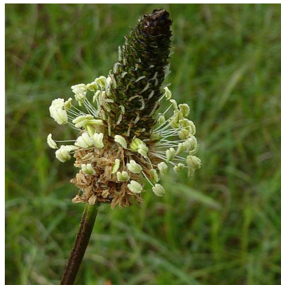
Ribbed plantain ( Plantago lanceolata ) is a common weed, probably too common on the reserve to be controllable. The flower spikes (above) are quite distinctive.