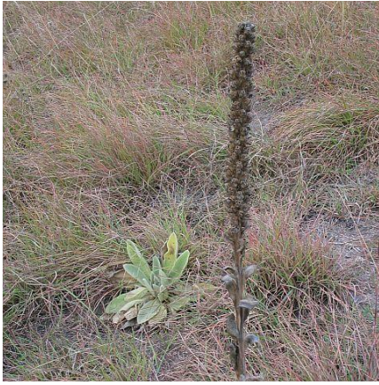
Giant mullein ( Verbascum thapsus ) is often called lamb's tongues. It has grey furry leaves and a tall spike of yellow flowers.