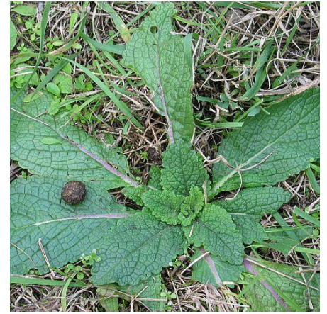
Twiggy mullein leaves are hairless, with deeply impressed veins. Both form large rosettes which cover a lot of ground.

The mulleins produce huge amounts of fine seed like pepper, and it is very long-lived in the soil. Prevention of seeding, or careful removal of the seed head for safe disposal is important. Keep the seed head upright while handling it to avoid spilling seed.