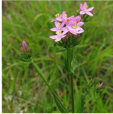
Pink centaury ( Centaureum species) is a small weed to about 20cm high. It can become common in wet springs.