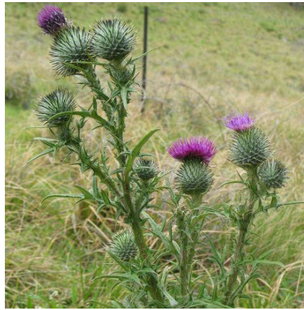
Black thistle ( Cirsium vulgare ) is the most common thistle in the valley. It is not common on the reserve, so it is worth chipping out the seedlings to prevent it getting established. Most seedlings are in the moister treed areas around the edges.