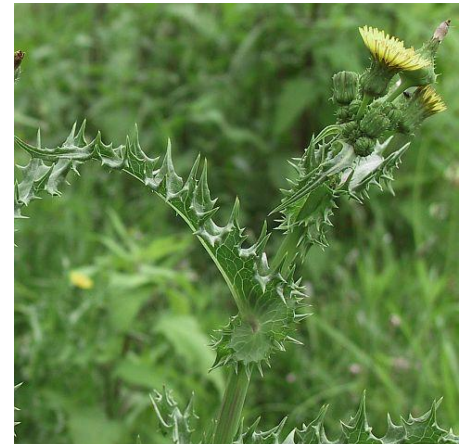
Prickly sowthistle ( Sonchus asper ) is also uncommon and worth chipping out. It has a less prickly relative, Sonchus oleraceus , which is also worth removing. Both have leaves which are less spiny than black thistle (can be pulled by hand) and leaves are more grey-green.