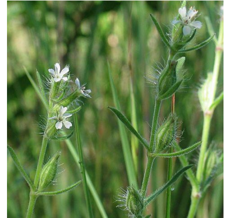
French catchfly ( Silene gallica ) is so named for the sticky hairs on all parts of the plant. Its flowers may be white, pink or red and white.