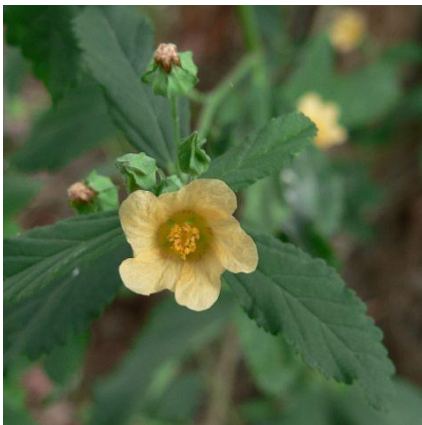
Paddy's lucerne ( Sida rhombifolia ) is a small shrub to about 1m high. It has very tough stems and roots and is impossible to hand pull. There is a large infestation around the weedy high point of the reserve. Plants elsewhere would be worth chipping.