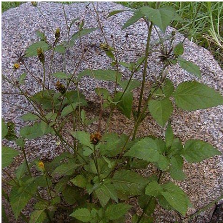
Cobbler's peg ( Bidens pilosa ) was thought to be introduced for a long time, but was apparently collected by Joseph Banks at Botany Bay, suggesting it is native. The black seeds that stick to clothing make it a nuisance and it is not well established, so worth removing anyway.

The mulleins produce huge amounts of fine seed like pepper, and it is very long-lived in the soil. Prevention of seeding, or careful removal of the seed head for safe disposal is important. Keep the seed head upright while handling it to avoid spilling seed.