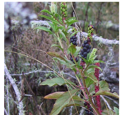
Inkweed ( Phytolacca octandra ) is spread by birds and pops up under trees. Chip in passing.